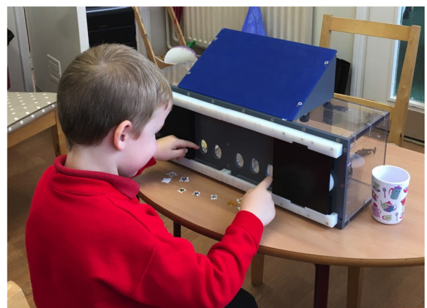
Fig. 2 Participant interacting with puzzlebox. Four-year-old boy solving the third stage (right side) of the Dean et al. (2012) puzzlebox.

Children were tested individually, in contrast to the group condition used by Dean et al. (2012). Each child participated in one 20 min trial (i.e., the maximum amount of time pilot trials