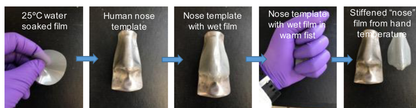
Figure 2. Images of a wet 30 wt % t -CNC- g -POEG2MA/PVAc composite stiffened enough to retain the shape of a human nose upon exposure to a warm hand. Reproduced with permission from ref 1. Copyright 2017 American Chemical Society.