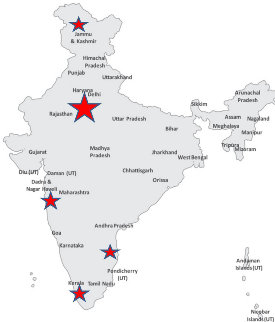
Figure 3. Geographical distribution of the cohorts from the selected studies. The size of the stars are proportional to the size of the study cohort.

All 13 FEOTN publications reported data on BRCA1 and/or BRCA2 and only three studies tested for other susceptibility genes such as TP53, RAD50, RAD52, ATM, and CHEK2, with mutations in these found very rarely if at all. We therefore limited our analysis to BRCA1 and BRCA2 genes. Twelve studies reported previously