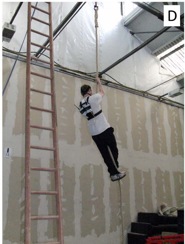
Figure 1. Horizontal jumping (A); pole swaying (B); climbing a ladder (C) and a rope (D).