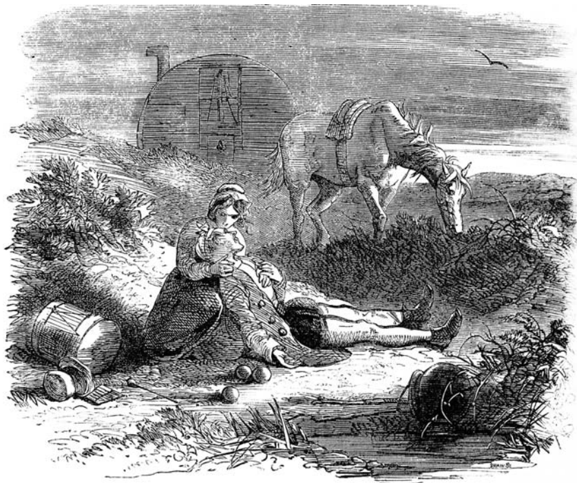
Figure 1: Phiz [Hablot K. Browne], illustration for “The Last Words of Juggling Jerry,” Once a Week 1 (September 3, 1859): 190.

he renders God in his own image—a juggler—rather than vice versa. Jerry’s death is figured as God’s own cheat wherein life on earth is “juggled away” from the living. 27 As for his wife, the poem tells us that she has lived long and hard, yet she appears remarkably young and pretty in the accompanying illustration. Further, the couple’s positioning in the illustration suggests mutual adoration and affection while the poem evinces an imbalance. The juggler attests to his wife’s value—“But it’s a woman, old girl, that makes me / Think more kindly of the race: / And it’s a woman, old girl, that shakes me / When the Great Juggler I must face”—and to her skill in the kitchen as well as her fidelity: “Nobly you’ve stuck to me, though in his kitchen / Duke might kneel to call you Cook: / Palaces you could have ruled and grown rich in, / But old Jerry you never forsook.” 28 Jerry’s trustworthiness is questionable, though, as he also boasts that the queen herself has blest his entertainment. While the dramatic monologue structure requires an implied audience and while the juggler’s wife could be understood as that audience, her steadfast presence in the image overwhelms the ambivalence that grounds much of the poem, where the precise nature of the audience is