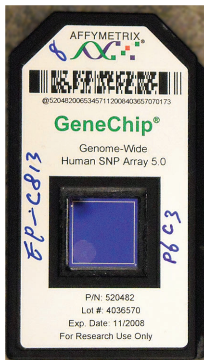
Fig. 2 Affymetrix microarray chip

The most widely used NGS technology, sequencing by synthesis (Illumina, San Diego, California, USA) allows entire human genomes to be sequenced within 24 h at low cost, with the sub $1000 genome barrier (X-prize) being achieved earlier this year. Other innovative technologies include single molecular real-time sequencing (PacBio® SMRT™; Pacific Biosciences, Menlo Park, California, USA), semiconductor sequencing (Ion Torrent™; Life Technologies, Paisley, UK) and nanopore sequencing (Oxford Nanopore, Oxford, UK). Until recently, NGS was limited to small studies on a few samples owing to cost constraints, but because of the rapid fall in price-per-sample (Fig. 3), large studies are now in progress. The Cancer Genome Atlas (TCGA) project is sequencing the cancer genome of 33 different cancer types in the US population; the 100 000 Genomes Project in the UK is undertaking to sequence 50 000 cancer genomes and 50 000 rare disease genomes over the next 5 years.