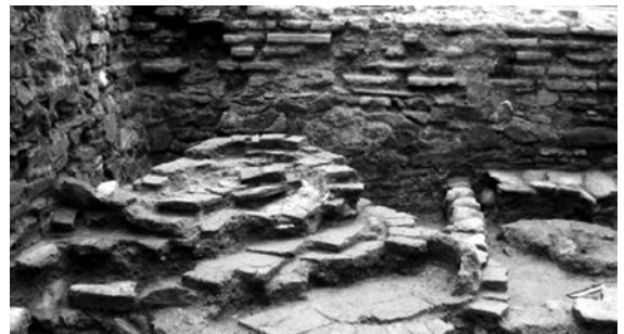
35. Thessaloniki: glassmaker's workshop.

The archaeology of the principal new monuments of Late Roman cities – churches and their ancillary buildings – is often also a documentation of the transformation of civic spaces, of the public and private aspects of Christianization and many linked cultural processes. The University of Athens' excavations at Palaiopolis, Andros (site of the ancient city of Andros) continued in 2009 to explore the construction, upon the lower terrace of the city's agora, of an Early Byzantine basilica ( Fig. 37 ). The floor mosaic includes an élite donor's inscription (a not uncommon feature of the floors of these churches). Excavations by the 16 th EPCA in 2010 explored an Early Byzantine cemetery basilica just outside the eastern walls of Thessaloniki (Plateia Syntrovaniou). As excavations have made plain, monumental churches were not rapidly built within cities' walls (except by imperial intervention) after the Edict of Toleration, so this church (as opposed to 'house churches') may have been as close as the Christian