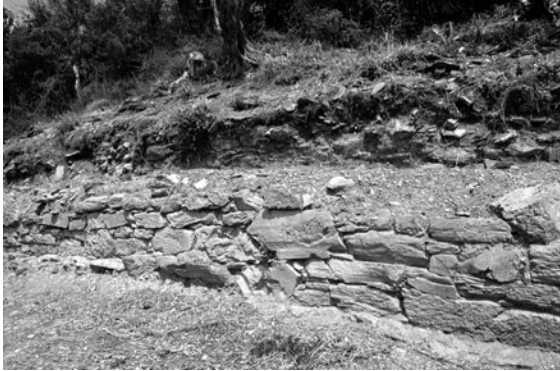
34. Velika, near ancient Meliboia: re-use of Hellenistic walls in Byzantine fortress.

Different but complementary aspects of the Late Roman cities of Greece continue to be revealed by surveys and excavations, demonstrating the value of both methods. The intensive survey by the Dutch-Slovenian Eastern Boeotia Archaeological Project (EBAP) plotted the shrinkage of the settled area of Koroneia in Late Antiquity, and the same mission explored, in the extramural area of ancient and Late Roman Thespiai, part of a clearly large Early Byzantine basilica at Makri Ekklesia, Thespias . Those familiar with the earlier Boeotian Survey will know that Late Roman/Early Byzantine Thespiai was focused upon a small spolia-built fort. This large basilica was built outside the now-invisible fort in its suburbium . On the site of ancient and Late Roman Sparta (or perhaps of Late Roman Sparta's suburbium ?) the 5 th EBA reported the discovery on Alcman and Lysander Street of an olive press 'in proximity' to an Early Byzantine basilica, a juxtaposition which is extremely interesting for the total archaeology of ecclesiastical complexes: a fast-developing story. The Ephoreia has also found (2006–2009) monumental structures which may have Late Roman and Middle Byzantine phases on the site of ancient Sparta (but, implicitly outside the Late Roman defences; see ID1903, 1904, 1905; see also ID1906, Sparta acropolis basilica).