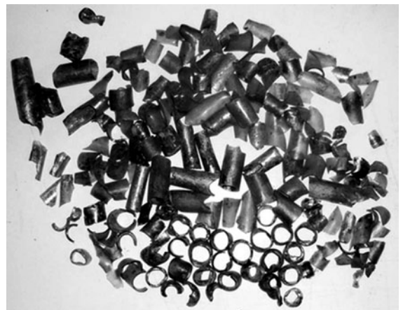
36. Thessaloniki: fragments of vessels from the glassmaker's workshop.