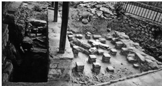
31. Ag. Menas, Velvendos, Macedonia: hypocausts and remains of marble paving in baths attached to the church.

An important and continuing trend is the discovery and exploration of Late Roman ‘villas’, once an apparent rarity in the Greek Aegean. In the northern Aegean, at ancient Hephaestia , Lemnos, the Italian School explored a colonnaded peristyle house whose total dimensions are not yet stated. If within a still coherent urban site, it belongs to a well-documented feature of towns in Late Roman Greece. Otherwise it belongs in the equally interesting suburban or rural category. Coins in the destruction layer include a follis of Heraclius of 610–611. The second decade of the seventh century witnessed violent destructions at urban and rural sites all over northern Greece (the mainland and islands, for example Thasos), whose causes are much debated. In Macedonia (nomos of Kozani), at Ag. Menas, Velvendos , the 17 th EBA explored a well-appointed baths complex (Fig. 31) attributed to a suburban villa whose full context is not yet known. There is an associated coin of Justinian (527–562). However, one should also consider the possibility that this complex belonged to an ecclesiastical establishment.