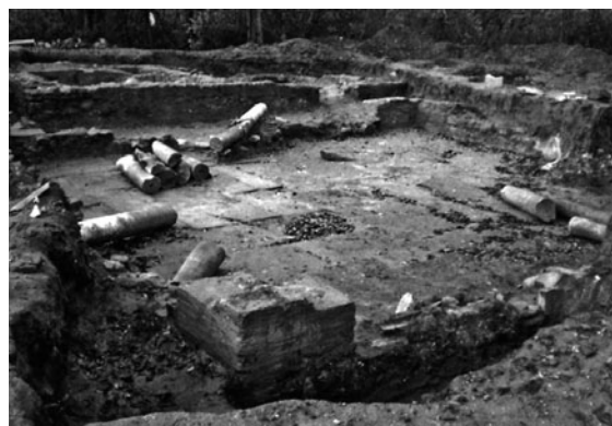
33. Ag. Menas, Velvendos: Proto-Byzantine bath complex northwest of the basilica.

Rarely explored, but of great significance for any understanding of the Late Roman settlement patterns of mainland Greece (arguably with the exception of the Peloponnese), are rural fortifications of various origins. The 7 th EBA explored in 2008–2009 the fortress of Velika , in the vicinity of ancient Meliboia, Thessaly (Fig. 34). The site overlooks an important north-south route through eastern Thessaly and partly reconditions an ancient fortification. It is powerfully constructed in a lime-mortar bonded masonry. It contains a church (whose dimensions seem not yet established) and has yielded sixth- to seventh-century pottery. It thus has all the characteristics of a type of Late Roman site found throughout the Balkan peninsula. Interestingly, a similar complex at Kastri Livadiou , near Doliche in Thessaly, was previously reported by the 7 th EBA.