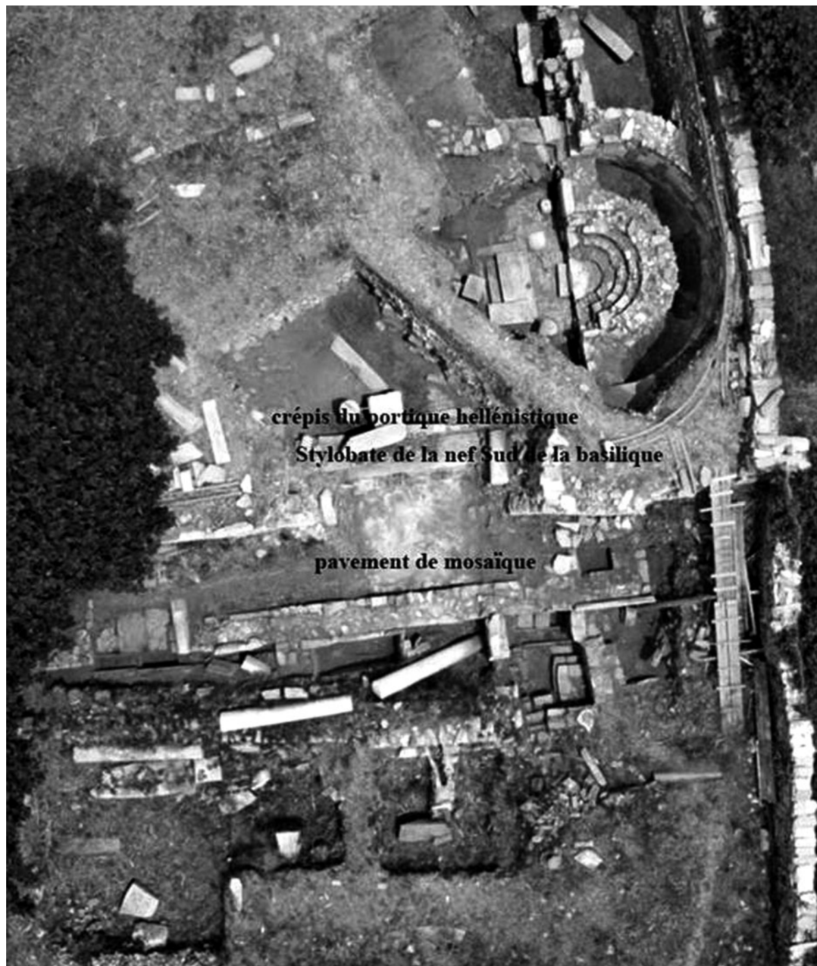
37. Andros, Palaiopolis: aerial view of the mid fifth-century three-aisled basilica, succeeded in the second half of the sixth century by a single-aisled church.

community could be to the city for many years. Sparta provides a potentially ambiguous example of the arrival of monumental churches within urban centres. Is the basilica of ca. AD 500 recorded by the 5 th EBA on the property of A. Biba and St. Spyridakou in 2007 within the Late Roman enceinte or not? In a very real sense the presence, extra-mural or intra-mural, and other characteristics of Early Byzantine churches provide yardsticks by which to