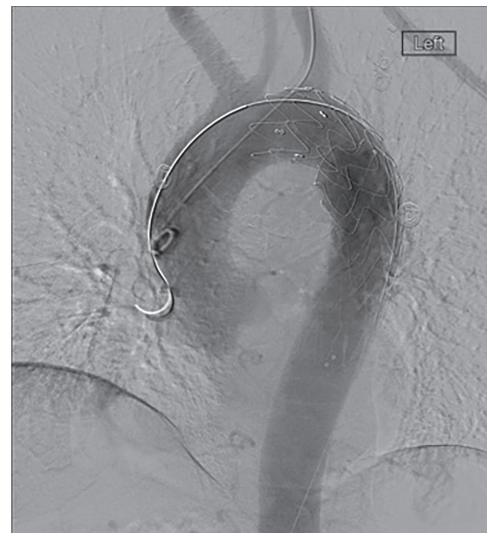
Figure 3: CT scan demonstrating patent stent with no suggestion of endoleak and lack of contrast in aneurysm sac.

The patient was transferred and stabilized on the critical care unit and discussed with the interventional radiologist. In conjunction with the interventional radiologist and cardio-thoracic teams, the patient underwent radiological stenting of the large aneurysm with TEVAR procedure (Figs 2 and 3). Following the procedure, the patient continued to have large volume haematemesis and melaena and underwent repeat oesophago-gastro-duodenoscopy which demonstrated large amount of blood and clot in the distal oesophagus and stomach with continuous brisk active arterial bleeding at approximately 40 cm, which was unsuitable for any endoscopic therapy. Follow-up CT angiography demonstrated satisfactory appearances of the thoracic aortic stent graft with no evidence of endo-leak. The left subclavian artery was well opacified, and the excluded aneurysm sac contained multiple locules of gas suspicious of ongoing fistulous communication with the oesophagus. Following further stabilization, the patient underwent repeat procedure with identification of a tear in the lower third of the oesophagus. The patient was subsequently managed as an oesophageal perforation with no fluid or oral intake and was commenced on peripheral total parenteral nutrition prior to definitive primary repair.