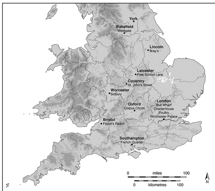
Fig. 1 Location of sites discussed in Table 1