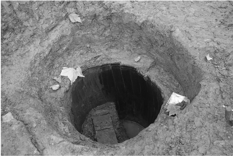
Fig. 3 A barrel latrine from Finzel's Reach, Bristol