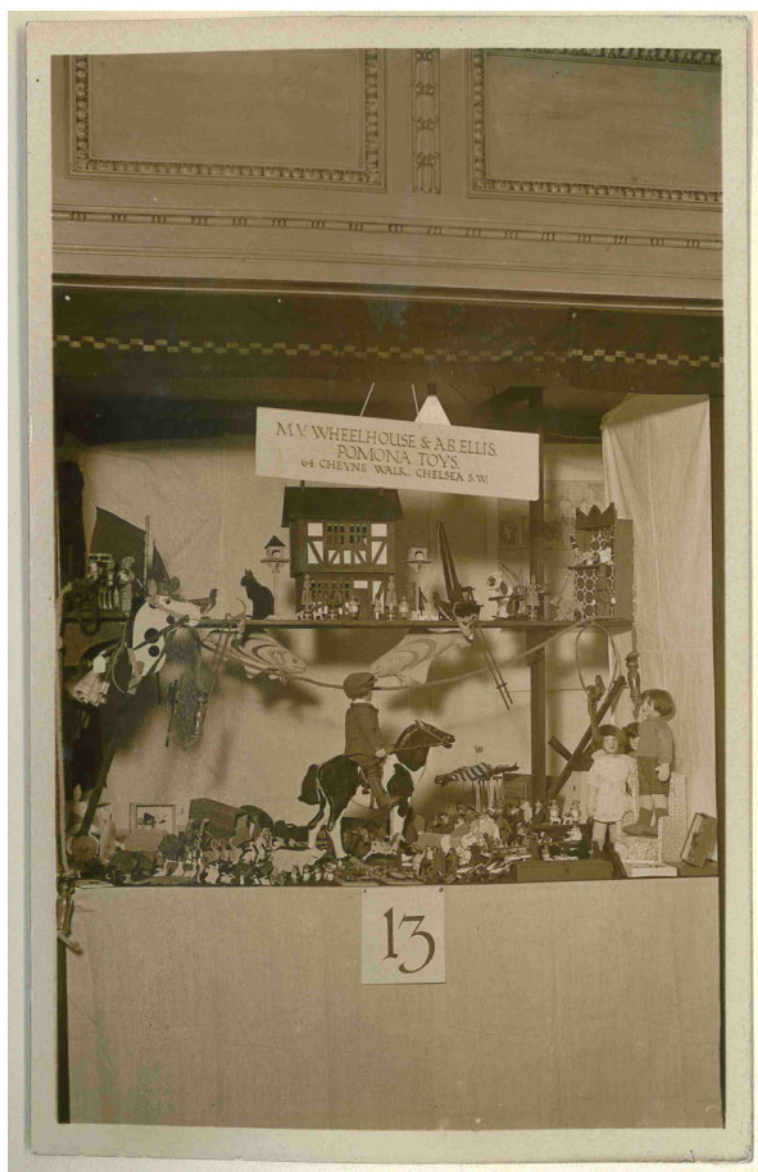
6. Pomona Toy's stall at the Red Rose Guild exhibition in the 1920s. Image kindly provided by the Crafts Study Centre, University for the Creative Arts, RRG/2/1.