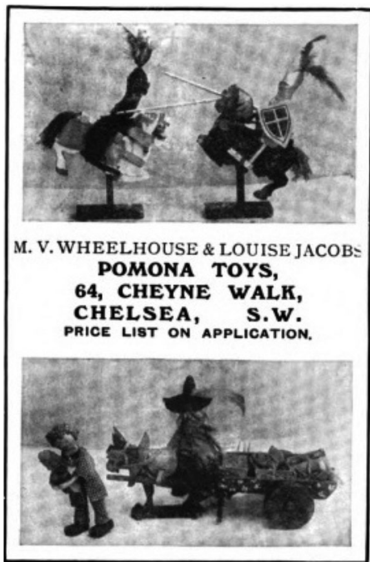
2. Advertisement for 'Pomona Toys', Studio: An Illustrated Magazine of Fine and Applied Art , lxviii (1916), iii.