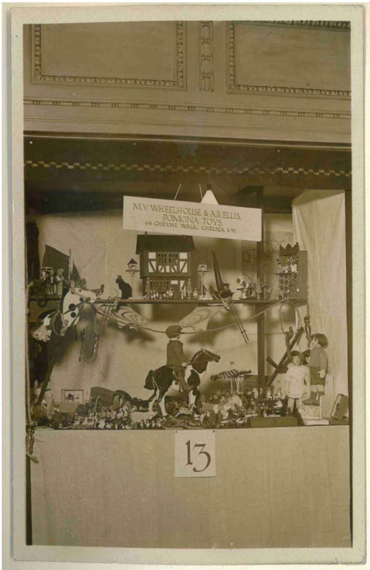
6. Pomona Toy's stall at the Red Rose Guild exhibition in the 1920s.