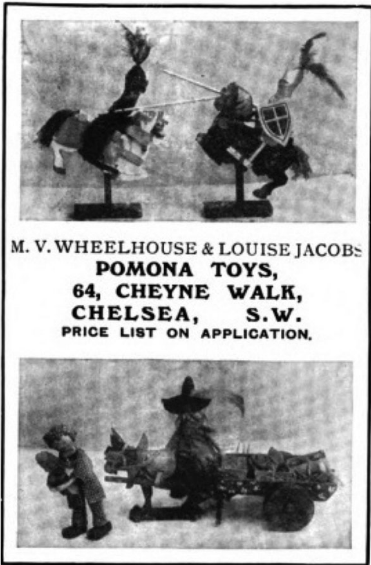
2. Advertisement for 'Pomona Toys', Studio: An Illustrated Magazine of Fine and Applied Art , lxxviii (1916), iii.