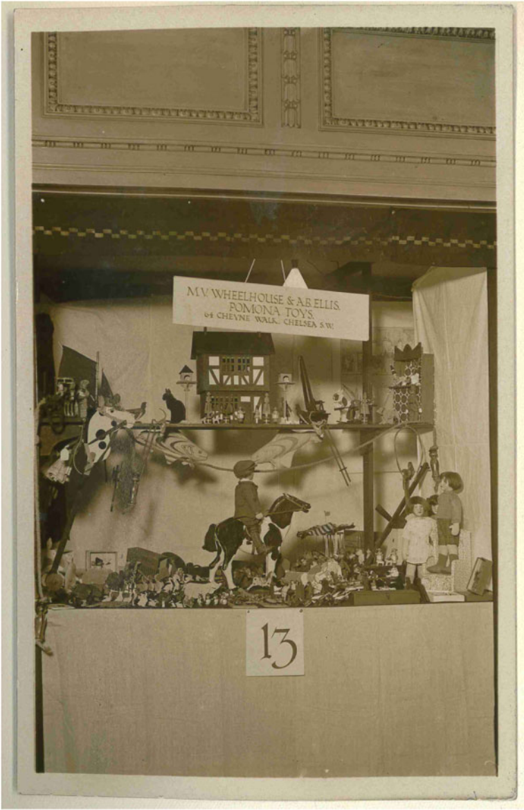
6. Pomona Toy's stall at the Red Rose Guild exhibition in the 1920s.