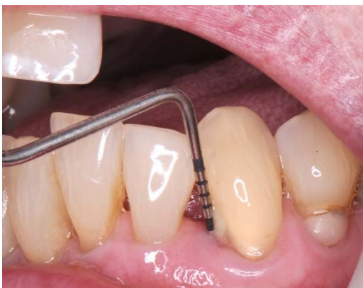
Figure 2 shows a probe inserted into a mesio-buccal pocket with suppuration evident. Consider the environment that the probe is in. Is it “inside” or “internal” to the body? Or can it be thought of as being on the “surface” of the body? Bacteria that exist in this environment, exist in a biofilm on the surface of the tooth and planktonically in the exudate from the pocket.

this external infection is compounded by the fact that the bacteria are present in a biofilm, as opposed to floating around planktonically,