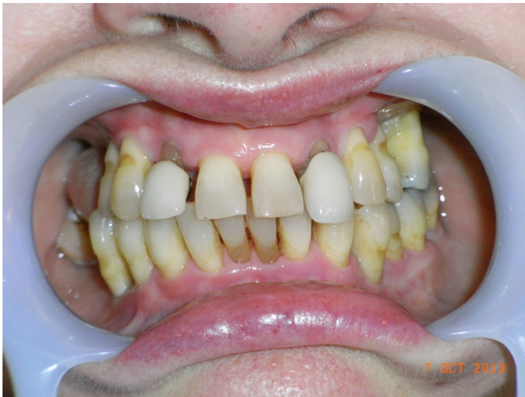
Figure 5. Patient from Figure 1 following 18 months of maintenance therapy.