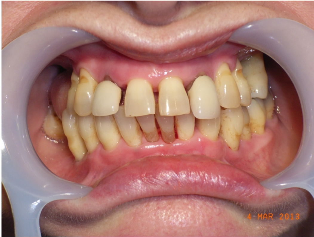
Figure 4. Patient from Figure 1 immediately following non-surgical initial therapy.