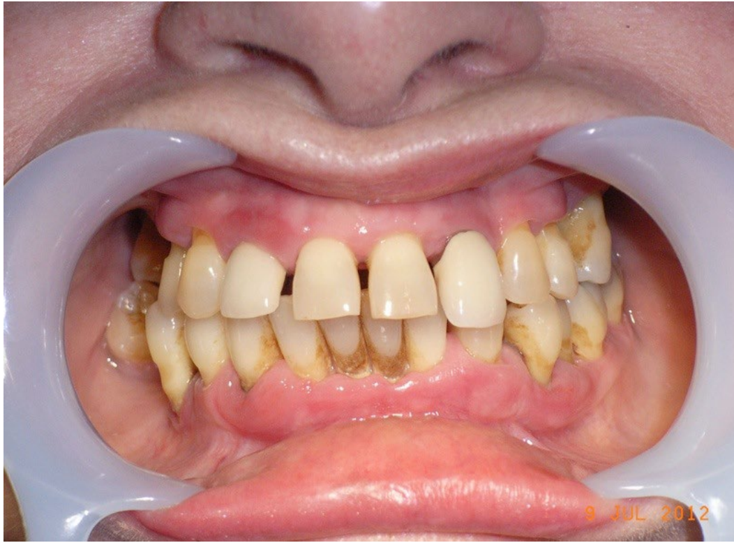
Figure 2. Patient from Figure 1 after 6 weeks of implementing a tailored oral hygiene regime alone.