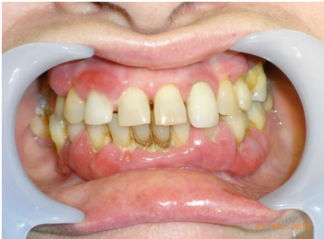
Figure 1: Patient at presentation. Note increased plaque buildup UR quadrant compared to UL.

A plaque score aims to quantify the presence/absence of plaque on buccal, lingual/palatal and interproximal surfaces of all natural teeth. It is usually expressed as a percentage of all such scorable surfaces of teeth, and can be used as an indicator of levels of home care. Plaque score is also used as a patient motivator as well as a guide to providing tailored oral hygiene instructions (OHI). For example, the patient in figure 1 demonstrates increased levels of plaque build-up in the upper right (UR) quadrant and less so in the upper left (UL) quadrant. This patient can be congratulated on achieving a good result in the UL quadrant and use this to motivate improve oral hygiene in the UR quadrant.