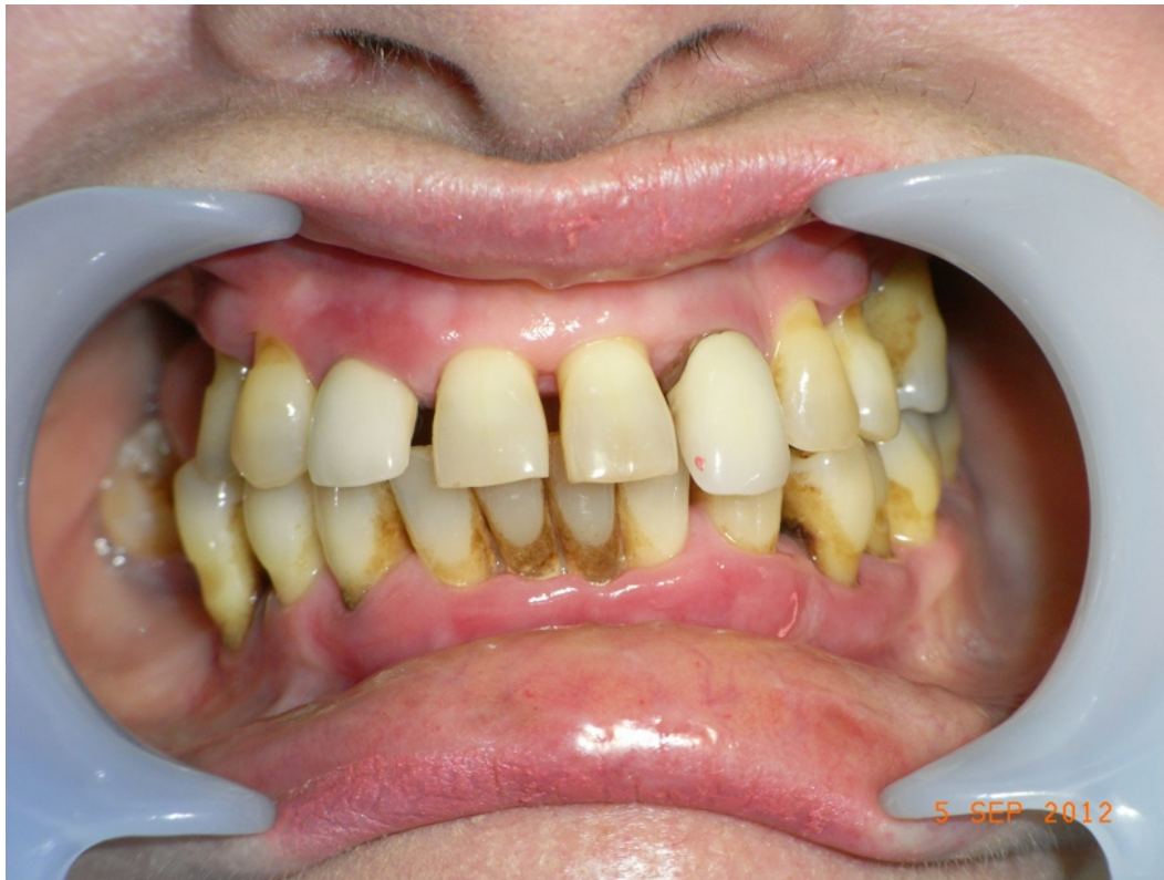
Figure 3. Patient from Figure 1 after 3 months of implementing a tailored oral hygiene regime alone.