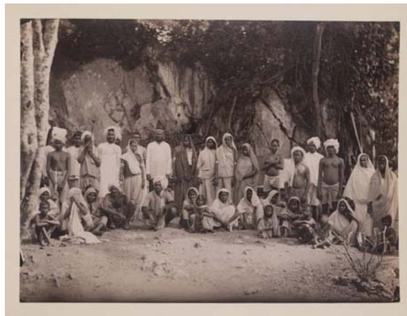
Figure 3. Indentured Indian Labourers, Trinidad, c.1890-1896