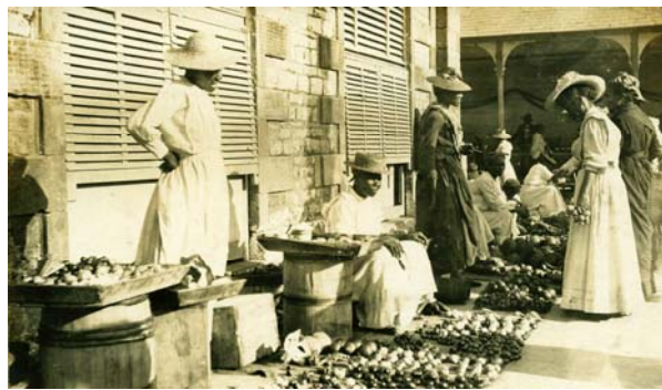
Figure 4. A Market, Port of Spain, 1910

artisan trades such as fishing, seafaring, boatbuilding, forestry and timber cutting (Higman, 1984). Similarly, Indian women developed a range of distinctive economic activities, such as the production and sale of milk, which also provided an important and alternative means of independent income (Hussain, 2012) (see Figure 6). In 1891, 68 of 71 milk sellers were Indian, and 44 were women (Census of Trinidad, 1891). The Caribbean tradition of women’s independent economic activity has thus influenced the construction of their work identities, both historically and today.