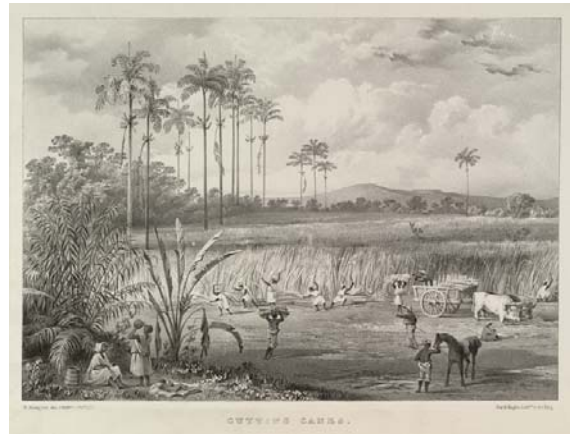
Figure 2. Cutting Sugar Cane, Trinidad, 1836