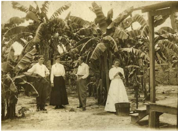
Figure 1. Plantation Owners, Trinidad, 1893