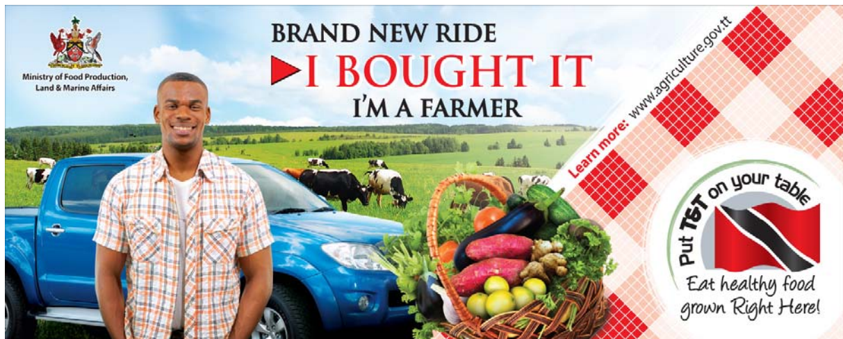
Figure 8. MFPLMA Billboard Campaign, 2012

Thirdly, the messages in the billboards speak directly to questions of ‘status’. Farming is presented as a metaphor for success and power. However, in each instance there is a disconnect between aspirational statements and reality. Figure 8 proclaims: ‘Brand new ride, I bought it, I’m a farmer’. The assemblage of messages and pictures on this billboard makes a connection between successful masculine ideals and the ability to purchase status symbols, and, in particular, a pickup truck, which is highly valued in Trinidadian society. The inclusion of a farmer with a vehicle here also references the Ministry’s Agricultural Incentive Programme (AIP). Yet it is extremely difficult to actually access these incentives. Rather than offering a loan, the programme offers 20 percent of the price of a new or used light goods vehicle, but the subsidy is only paid after the purchase, so the farmer is required to find sufficient capital to cover 100 percent of the upfront cost (MFPLMA, 2011). Many dairy farmers cannot afford to buy even a small, very old second-hand vehicle, let alone a brand-new Toyota Hilux pickup truck, which would cost approximately TT$330,000 (US$50,000).