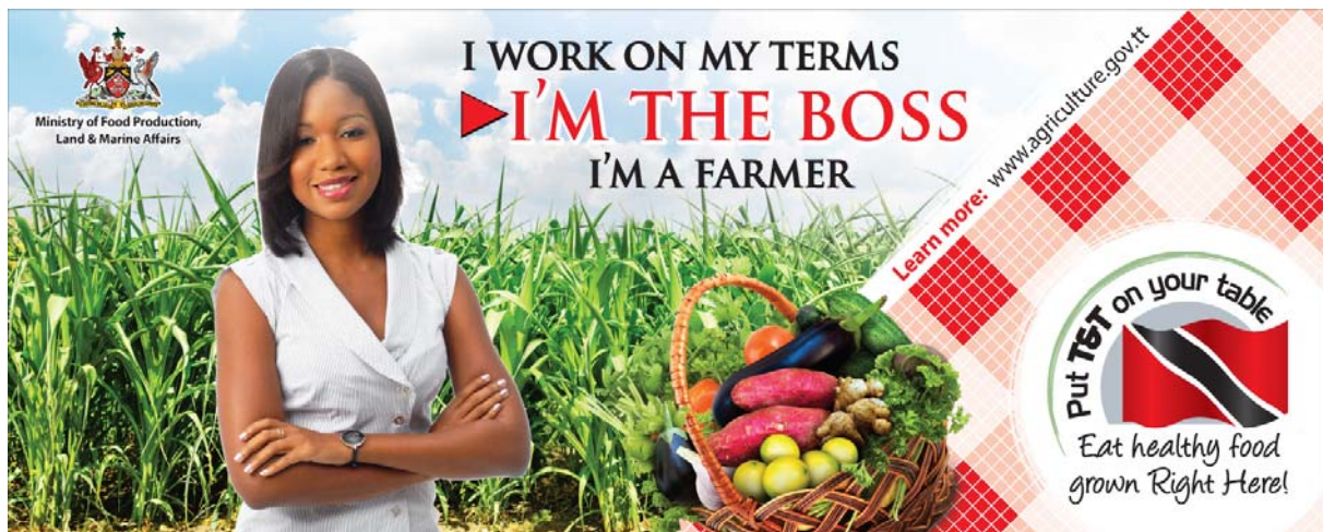
Figure 9. MFPLMA Billboard Campaign, 2012

I came across the fact that I should have been an East Indian pioneer'. 33 The billboard is, therefore, potentially only an envisioned reality for an already-wealthy farmer, most likely with additional wealth coming from other sources – ‘the gentlemen farmer’ or the ‘retired ex-Ministry official or Minister’. 34 Consequently, rather than re-envisioning farming, it could be argued that the Ministry is aspiring to attract a new strata of people towards it.