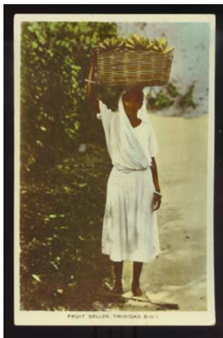
Figure 5. Fruit Seller, Trinidad, c. 1910s