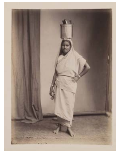
Figure 6. East Indian Milk Seller, Port of Spain, 1890

At the end of the 19 th century, women continued to make up a high proportion of the workforce, constituting nearly a third (32 percent) of those engaged in agricultural work and 44 percent of working adults. However, the highest proportion of women was found in the lowest-paid and lowest-status jobs. The most common job was ‘agricultural labourer’, of which they constituted 34 percent. They also made up 25 percent of estate proprietors, 23 percent of farmers, 20 percent of peasant proprietors, 8 percent of contractors and 3 percent of planters. However, high-status jobs such as ‘manager’ or ‘overseer’ were entirely male (see Table 1). A substantial proportion of those working in agriculture were also Indian. Despite only comprising around a third of the