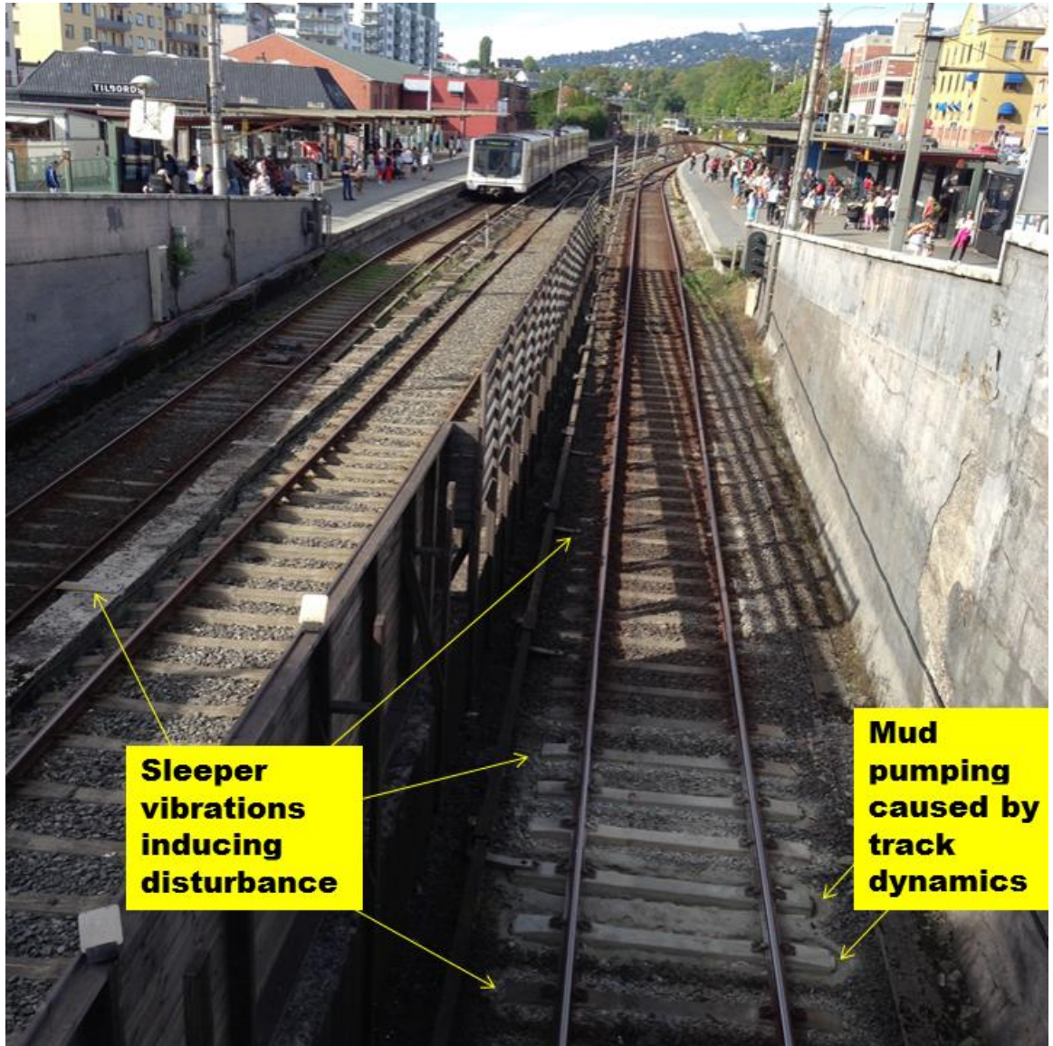
Figure 1 a) Real evidence of structural vibration impairing track performance and damaging track components. Obvious track gradient implies that any drainage problem could be minimal in this situation.