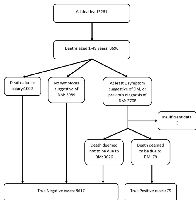
Figure 1 Study flow chart.