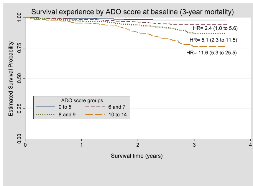
Figure 2 Kaplan–Meier plot of survival experience of patients by ADO score group at baseline. ADO score 0 to 5 used as the reference group (N= 1701).

outcome (N=1,036) and resulted in worse discrimination (AUC= 0.71; 95% CI: 0.67–0.76) and calibration (slope= 0.82; 95% CI: 0.62–1.02) (data not shown). An additional sensitivity analysis with only prevalent patients showed similar results for discriminative performance and calibration slopes ( Supplementary Table 2 ). In the complete cases, the calibration slope was decreased to 0.73 at 1-year mortality when compared to the analysis that included all cases. At 3-year mortality, calibration slope increased to 1.08 while discrimination increased to 0.77.