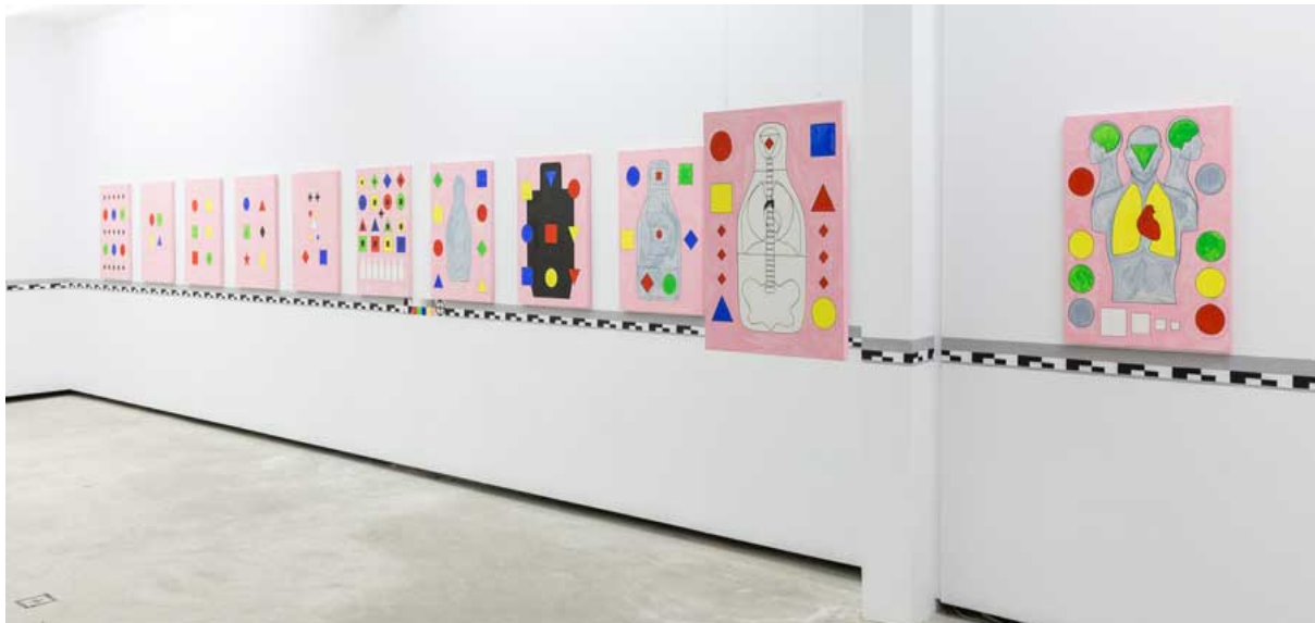
(Fig 2. ‘Shoot the Women First’.)