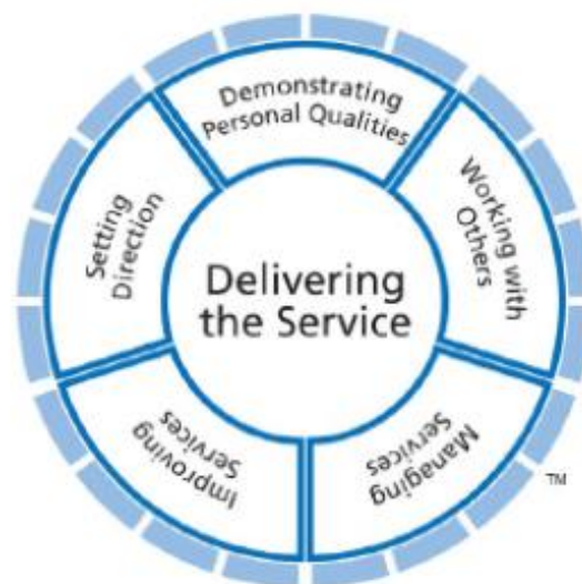
Diagram 2: Medical Leadership Competency Framework (NHSIII & AMRC 2008)

The Medical Leadership Competency Framework) complemented the NHS Leadership Qualities Framework (NHSIII 2006) produced as the benchmark for senior managerial leaders. These have subsequently been super ceded by generic frameworks which seek to accommodate both clinical and managerial roles, and formal and informal leaders (for example the NHS Leadership Framework (NHSLA 2011) and the NHS Healthcare Leadership Model (NHSLA 2013). Professional standards have placed increasing emphasis on the leadership competences both at qualification and at higher levels of clinical practice (Box 1) Reflecting the move towards more integrated care, these not only expect leadership across the same