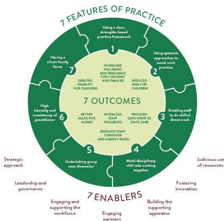
Diagram 1: Seven Features of Practice and Seven Outcomes (DfE, 2018)