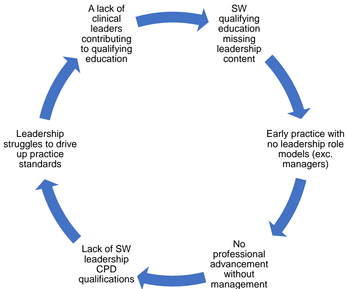
Diagram 4: A cycle of 'missing' leadership

Social work leadership needs a clear definition and relevant models of practice. Distributed, adaptive and collaborative leadership models would all seem to have some accord with underpinning social work values. These could potentially be combined with learning from clinical leadership models in healthcare to develop bespoke social work frameworks and approaches. In relation to a definition, this again needs to build on the distinct principles and purpose of social work, and to be relevant to social work in all the fields in which it is practiced: