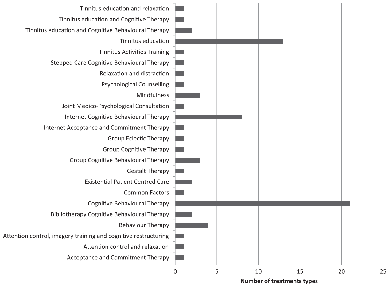
Fig. 2. The number of different types of treatment reported across included records.

manualization because the existential patient centered therapist should be prepared to work with whatever the patient brings to sessions. This presents an epistemological conundrum concerning how much we can know about existential PCT. Or more to the point, it is unclear what functional value an apparently unquantifiable approach to psychological therapy holds in this context. This caveat was not noted for any other type of psychological therapy reviewed here, and in no way is meant to minimize the potential positive impact of such approaches.