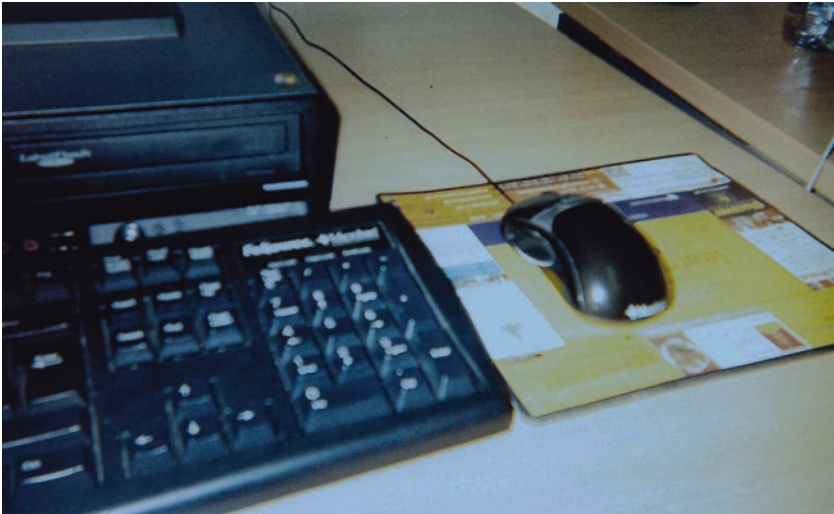
Fig. 1.2 The participant reported with this illustration “for a big part of time I was like looking on the internet... trying to understand what’s happened to me... there’s the part of this experience of ‘what’s going on?’ leads you to try and investigate”

about the present, and reported an increasing sense of mistrust of both their current thoughts and their current experience of “reality”: