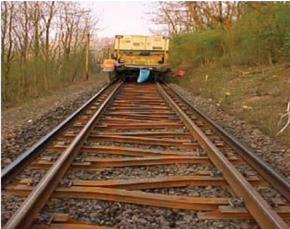
Fig. 2. Y-Steel-Sleeper

improving the characteristics of steel sleepers, the traditional orthogonal sleepers have been replaced by Y-steel-sleepers (Figure 2). The development of this new model provided a further reduction in weight of steel sleepers and gain of resistance against cross movements due to the amount of accumulated ballast in its central part as a consequence of its design similar to the letter Y (European Federation of Railway Trackwork Contractors, 2007; Tata Steel, 2014).