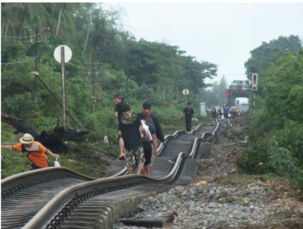
Fig. 4. Track condition after a flash flood in 2016. Concrete sleepers have ability to retain to certain extent the original alignment and geometry. However, it is important to note that replacing timber with concrete sleepers without improving ground condition can pose a significant georisk of formation failure and differential track settlements under various climate uncertainties such as high intensity rain, flooding and sea level rise.

Railway track structure and substructure are expected to resist the static and dynamic loads that are generated by the passage of moving trains. Additionally, the cyclic characteristic of these loads has a great influence on the track long-term behaviour. Without appropriate design, construction, inspection and maintenance of track components, track stability can be undermined and the georisks can be increased (Osman et al., 2017), as shown in Fig 4.