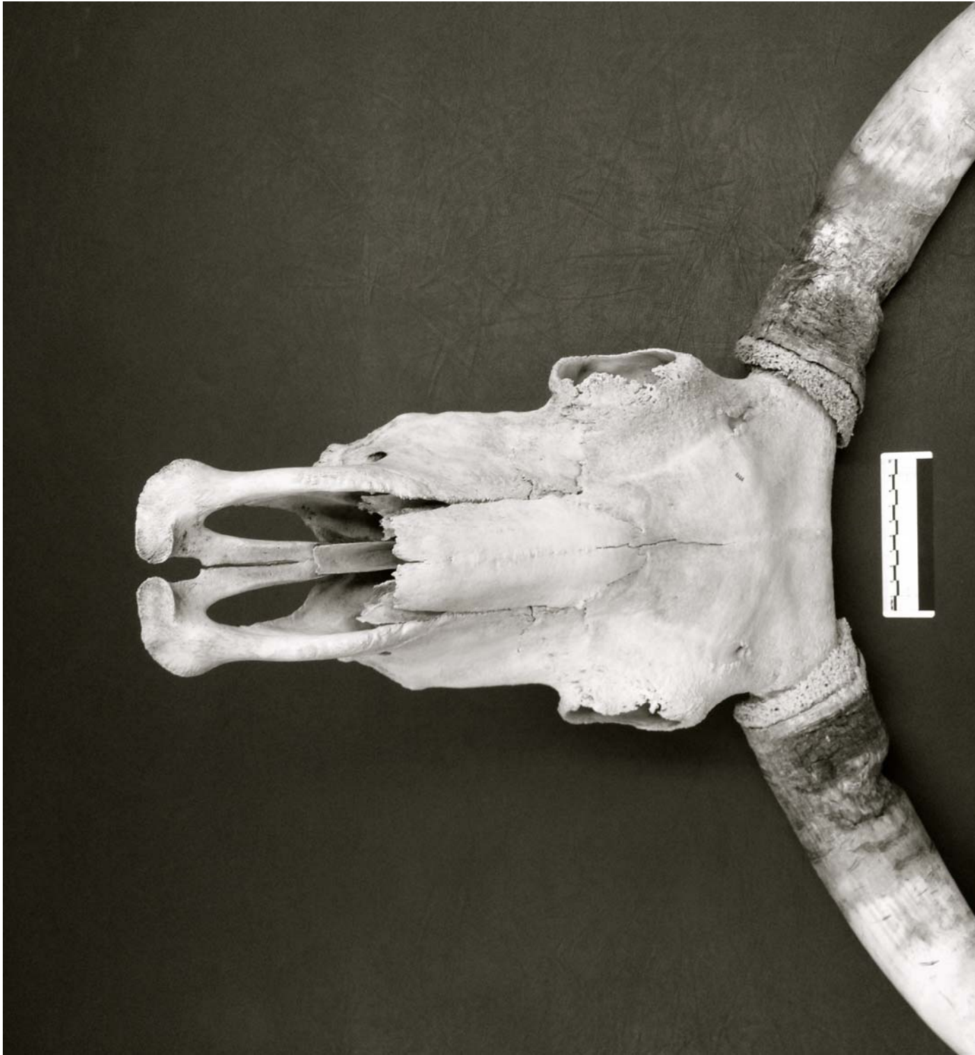
Fig. 1: ring depressions in the horns of a feral bull from Chillingham Park.