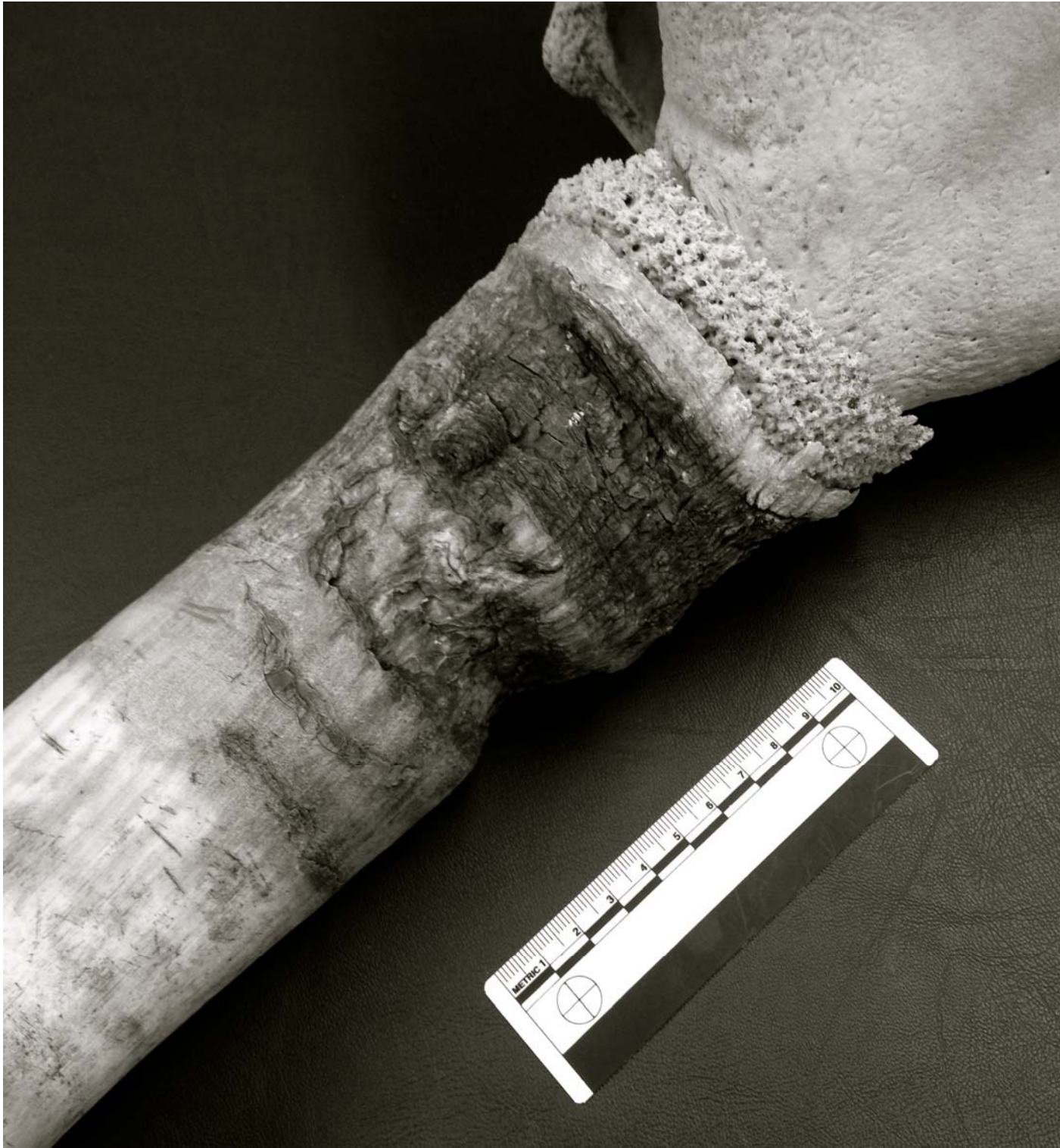
Fig. 2: close-up of ring depression in the left horn of a feral bull from Chillingham Park.