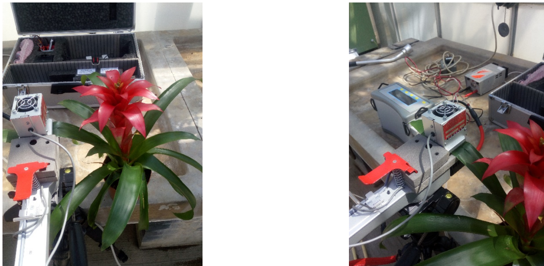
1 2 Figure 1: Images of the experimental setup for leaf \text{CO}_2 assimilation measurements, equipment pictured includes 3 infra-red gas analyser, leaf cuvette and external halogen light source.

6 The light response curves were based on an equation proposed by Prioul and Chartier (1977) and were produced 7 using the model by Lobo et al. (2013). Light compensation points - LCPs (which represent the light level where the 8 \text{CO}_2 assimilation is equal to zero) (Torpy et al. 2014) were calculated with the same model (Lobo et al. 2013) for all 9 taxa apart from Guzmania 'Indian night', which was omitted due to very low assimilation rates and therefore, 0 unreproducible results.