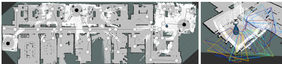
Fig. 2: Experimental Setup at G . Left: A robot makes 360° scans at several predefined waypoints in its environment. Right: robot plans views to investigate parts of the mapped environment.

We employ two datasets of observations taken by our robot during two long-term ( 3 months) deployments in two separate office environments a year apart. The first dataset was labelled by a human to produce 3800 views of various objects, with the data collection methodology following the approach of Ambrus et. al [7]. The robot is provided with a map, and a set of waypoints in the map that it visits several times per day, performing full 360° RGB-D scans of the environment at those points. The second dataset is as-yet unlabelled.