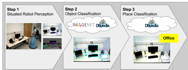
Fig. 1: Overview.

We use a robot platform to observe the environment at various waypoints specified in its environment. The robot is provided with a SLAM map of its environment, and a set of waypoints within this map. At each of these places the robot perceives its surroundings by taking multiple views at different angles (360°). The different views of the robot are aligned and integrated into a consistent environment model in which object candidates are identified and clustered into groups according to their proximity. For each object candidate, we predict its class by using its visual appearance as an input to classifiers trained on a large-scale object database, namely ImageNet. Based on the set of labelled (or classified) object candidates which are in the same group, we perform a web-based text-mining step to classify the region of space constrained by a bounding polygon of the group of objects.