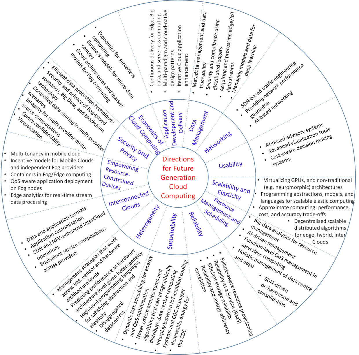
Figure 3: Future research directions in the Cloud computing horizon