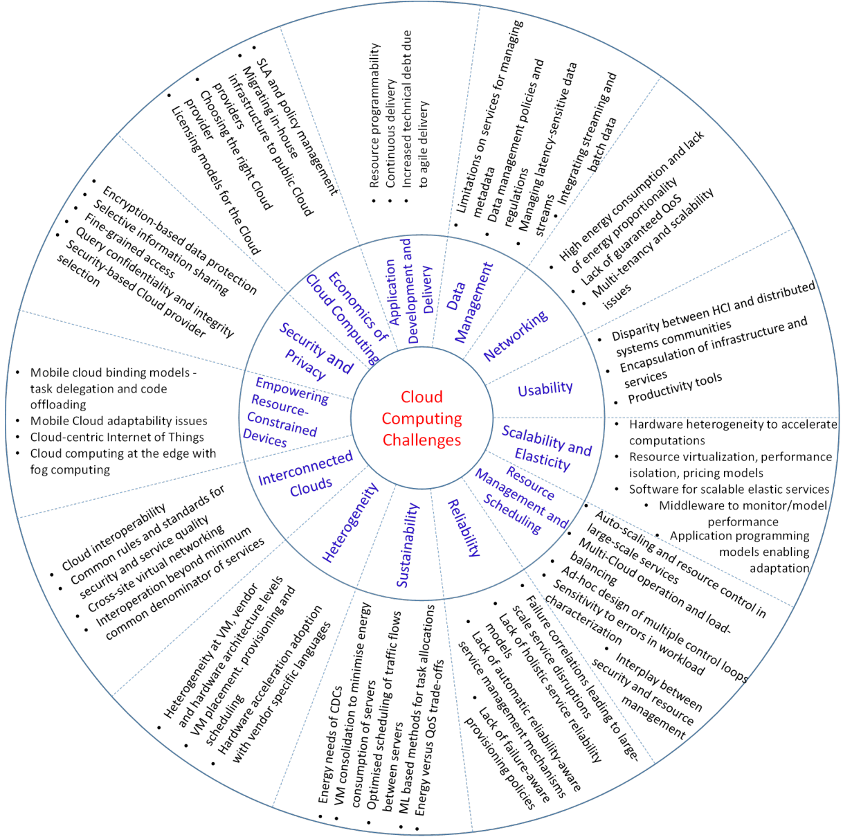
Figure 2: Cloud computing challenges, state-of-the-art and open issues