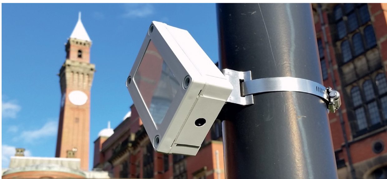
FIG. 1. Prototype road surface temperature sensor mounted, as operationally, on street furniture adjacent to a road. The small black hole is the thermopile aperture, which is aimed at the road surface.

Communications are traditionally one of the largest drains on energy, as significant power is needed to transmit the data. This can be overcome (where available) by using a hardwired solution, but many weather outstations presently rely on the Global System for Mobile Communications (GSM). These are power hungry, draining a small lithium battery in a matter of hours. The IoT now has a vast array of low-power wireless options to overcome this. These include Bluetooth, Wi-Fi, and ZigBee over short distances (i.e., meters/line of sight), but the latest developments