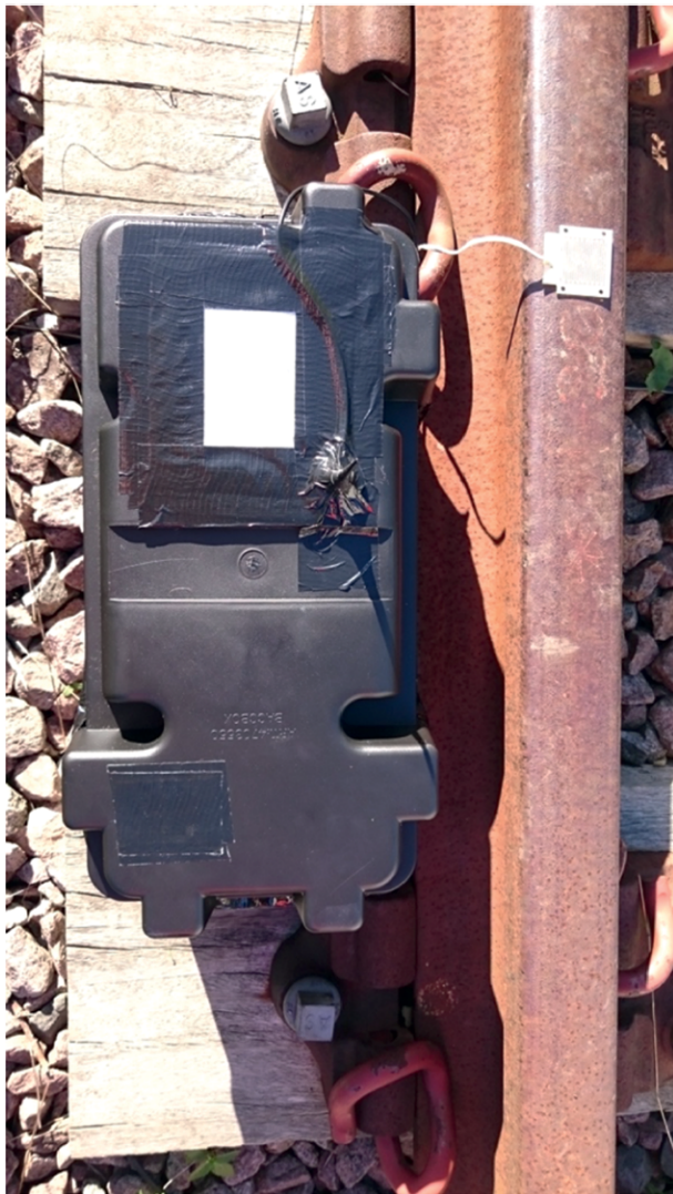
FIG. 5. Low-cost rail moisture sensor on trial using a dummy rail next to a live railway (image courtesy of Elliott Warren).

that the IoT can provide a complimentary observation module within RWIS. A simple network could involve locating a single sensor on each salting route (Fig. 4a). This in itself would provide a step change in granularity or observations, but the potential remains to instrument the network at the same resolution of a route-based forecast, for example, every 100 m (Fig. 4b), potentially transforming current winter resilience practices via selective salting or even dynamic routing (Handa et al. 2006).