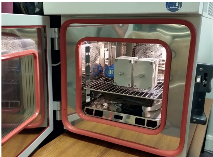
FIG. 2. The Weiss series WKL 34 climate chamber. Inside are four test sensors mounted above the slab of asphalt into which the reference thermistor is embedded.

to display large datasets in real time or indeed to push (or pull) data via application programming interfaces (APIs) to end users to ingest into forecasting models. While devices themselves can be intelligent, enabling processing tasks within firmware, the cloud allows for a “smart server–dumb sensor/client” approach, which is preferable to mitigate against security threats (Weiss and Lockhart 2012).