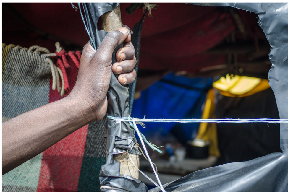
Figure 5: A Sudanese refugee in the Calais camp holds onto his ramshackle shelter, made from branches, string, and plastic bags [Colour figure can be viewed at wileyonlinelibrary.com ]

The architectural morphology of the camp was in a constant state of flux, with new refugees arriving daily and the regular construction of improvised shelters to escape the elements. Accommodation for the thousands of destitute residents consisted largely of ramshackle shelters made from scrap wood, branches and plastic sheeting as well as donated tents (see Figures 5 and 6). This too resulted in a slow violence on the refugee body: interviewees with breathing difficulties