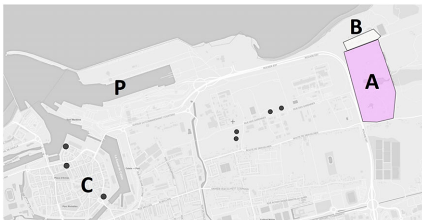
Figure 2: Map of the Calais Camp as it stood during the research period A = Informal New Calais camp or “new jungle”; B = Formal accommodation for 200 women and children; C = Centre of Calais; P = Port area for ferries to the UK; ● = Sites of forcibly cleared encampments [Colour figure can be viewed at wileyonlinelibrary.com ]

In recent years camps have been the landscapes of significant political change and revolution. The barricaded battleground of the Maidan in Ukraine, for example, which helped overthrow President Yanukovich (Phillips 2014), or the events in Egypt’s Tahrir Square where the “camp defeated the dictator” (Ramadan 2013b). While the geopolitical importance of these spaces has been made clear (Minca 2005), as well as their potential to be everyday sites of political resistance and urban experimentation (Katz 2016; Sigona 2015), the informal refugee camp within the EU has increasingly become a space of stagnation and a symptom of political failure.