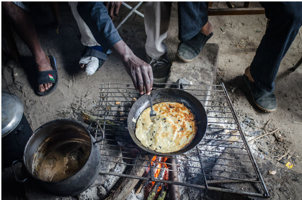
Figure 4: A refugee with an injured foot cooking in a makeshift kitchen inside the “new Jungle”; due to a lack of facilities for clean water and washing facilities, pathogenic bacteria was found in this and other makeshift spaces (see Dhesi et al. 2015) [Colour figure can be viewed at wileyonlinelibrary.com ]

The violence that refugees are exposed to in the camp has impacts across different scales, including at the microbiological level, thus highlighting what Farmer (1996:5) calls the “pathogenic roles of social inequalities”. Interviews with residents