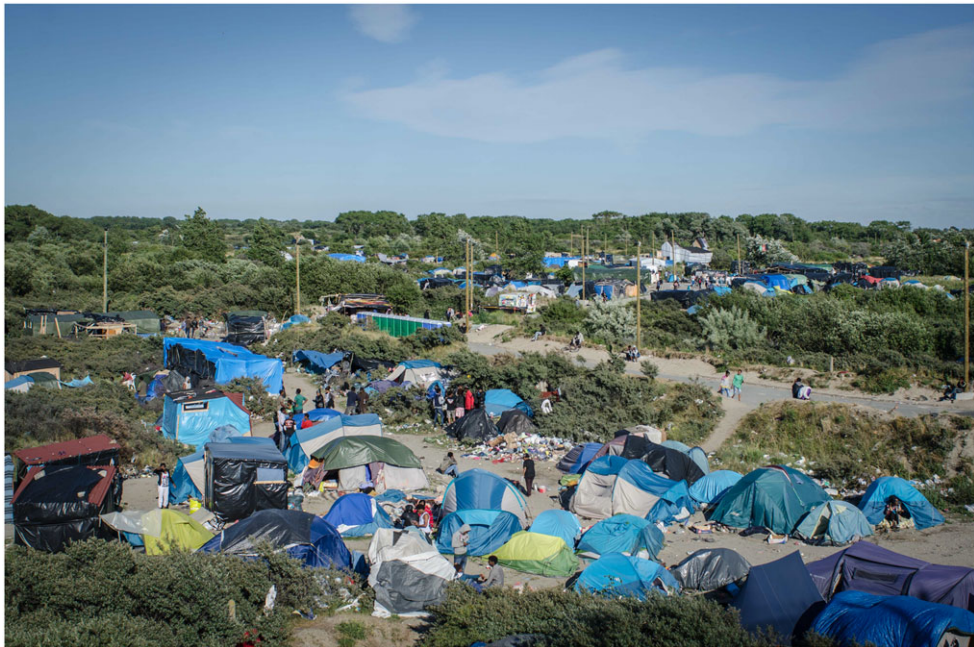
Figure 6: A view of the tents and makeshift structures in the western part of the Calais camp [Colour figure can be viewed at wileyonlinelibrary.com ]

reported their conditions worsening over time by damp and cold conditions, whilst all residents interviewed reported being extremely cold, especially during the night. This permanent wounding of refugees would not be as grievous if it was for a short period, but some residents had been exposed to such conditions for up to a year, articulating how they felt “trapped”. As security around the port town increased in the summer of 2015, the possibility of reaching the UK was reduced and the camp was increasingly seen as a temporary home, with refugees having built makeshift educational, community and religious spaces.