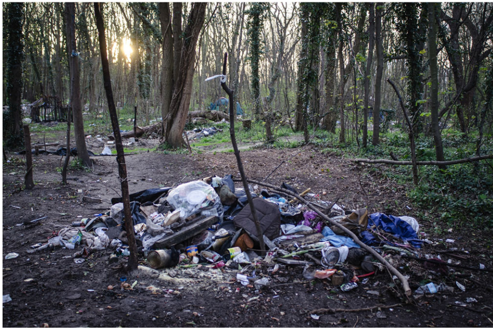
Figure 3: A former squatter camp near Calais, forcibly cleared by police in April 2015 [Colour figure can be viewed at wileyonlinelibrary.com ]