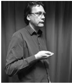
unmodified for agent