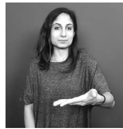
congruent for patient

Verb ends at a location in front of/away from the signer on the sagittal axis and either does not correspond to a location set up for the patient or no location was established prior to the verb's articulation.