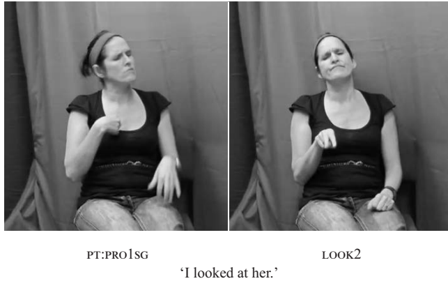
FIGURE 6. LOOK2 with constructed action and modified for the patient.

phemes and deictic gestures. During periods of constructed action, signers appear to be interacting with absent referents as if they were physically present within the signing space, as in Figure 6 where LOOK2 is produced with constructed action. The fact that we observe an increased likelihood of modification during periods of constructed action suggests that signers may be pointing to imagined referents (see also Cormier, Fenlon, & Schembri 2015).