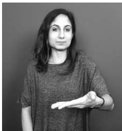
unmodified for patient