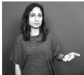
modified for patient