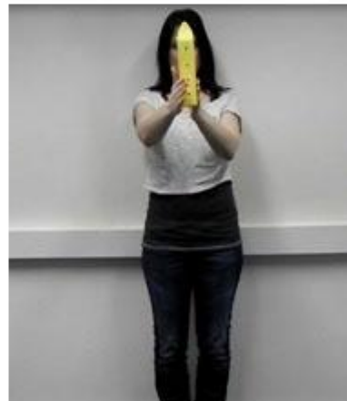
D: Test video 2