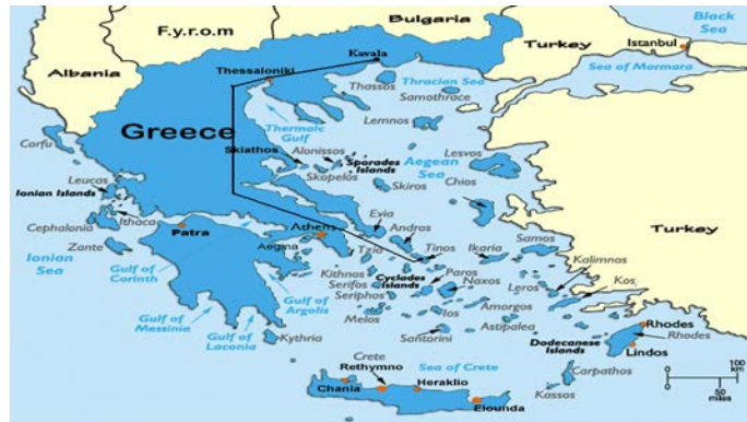
Figure 1. Trips' route

To further understand the complexities of religious tourists' motivations, in phase 2 of the research semi-structured, in-depth interviews were conducted in the participants' homes after their trips. Interviews lasted on average 75 minutes and were conducted after assuring participants' confidentiality and receiving their consent (Brinkmann and Kvale, 2015). In an attempt to understand the world from the subjects' point of view and to unfold the meaning of people's experiences (Kvale, 1996), questions addressed issues of motivation and meaning of the place to the participants, as well as exploring experiences and behaviours, feelings and values. While the same questions were used during two different time slots, the sequence of the questions varied according to the interview procedure. Additional probing questions were introduced where participants' responses required clarification (Fielding and Thomas, 2008), the emphasis being on what they considered as important, drawing also on the happenings, behaviours and emotions noted during the participant observation (phase 1). All interviews were digitally recorded, transcribed verbatim, and translated into English retroactively (O'Reilly, 2005) to ensure consistency in meaning. Informed consent was provided by all participants (Brinkmann and Kvale, 2015), pseudonyms being used to ensure anonymity.