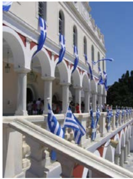
Figure 3. Church of the Annunciation, Tinos