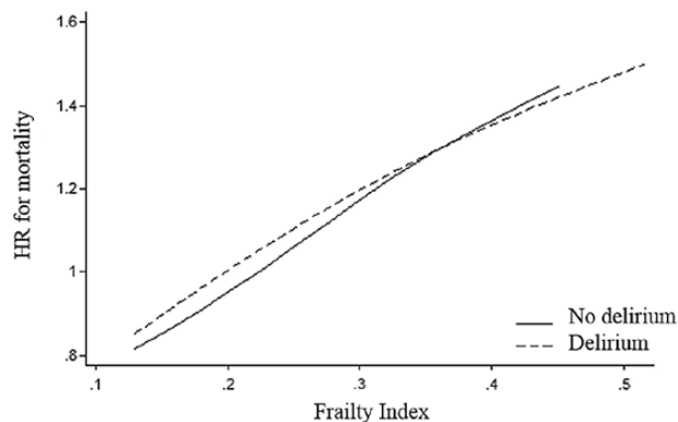
Figure 2. Relationship between frailty and mortality, by delirium status restricted cubic splines modeling relationship between frailty and mortality. The linearity suggests a continuous relationship between frailty and mortality. When stratified by delirium, the lines intersect suggesting greater effects with delirium at lower levels of mortality ( p = .07 ).

delirium is highest in the fittest patients. This highlights the crucial importance of preventing, detecting, and treating delirium in any patient, and recognizing it as a serious condition with prognostic significance.