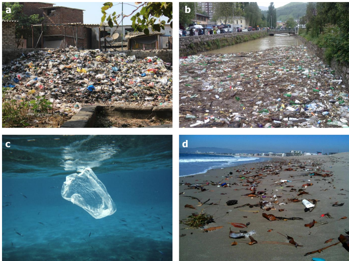
Fig. 2. Images of plastic pollution across a range of environments a) terrestrial, b) riverine, c) marine and d) coastal. Any large items can degrade to form secondary microplastics.

Although the majority of freshwater microplastic studies tend to focus on rivers, it is understood that microplastics are also prevalent within ponds and lakes. 23-25 In the same way as rivers, these will receive inputs from land runoff and wind-blown debris, however due to the enclosed nature of lakes it is likely that inputs of microplastics to standing waterbodies will lead to accumulation over time. 23