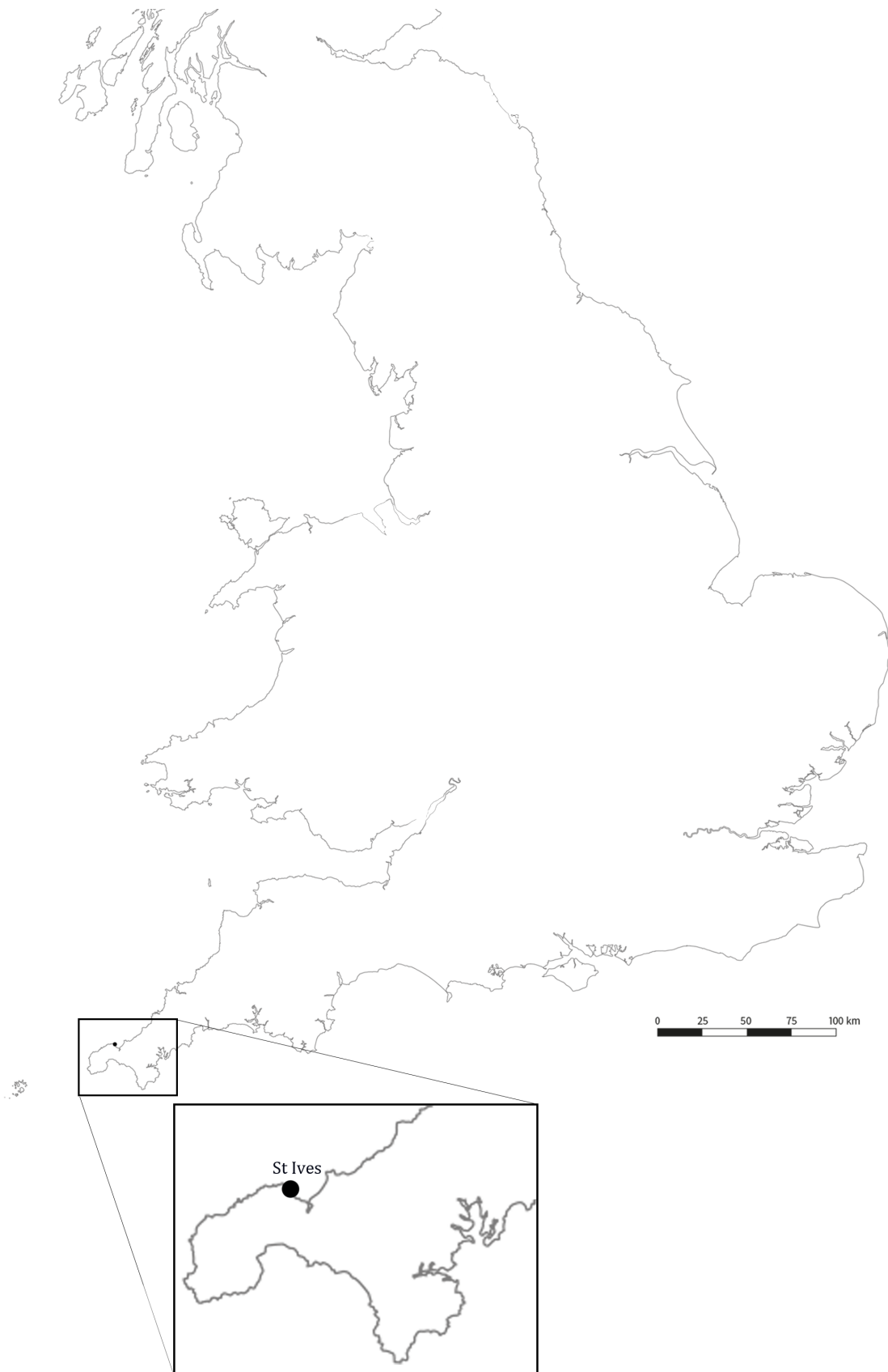
Figure 1. Map to show the location of St Ives in the UK