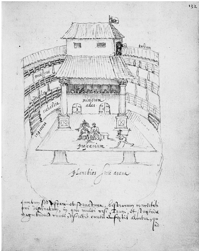
Figure 22.1 Arend van Buchell after Johannes de Witt, The Swan Playhouse , c.1596

The trumpeter's importance to the theatre is illustrated by his depiction in the famous Swan Playhouse drawing, copied by Aernout van Buchel from a lost picture by Johannes de Witt (Figure 22.1). That picture includes, elevated high above the stage, a hut out of which a trumpeter leans (Figure 22.2). If this is a mid-play trumpeter, then the picture shows how