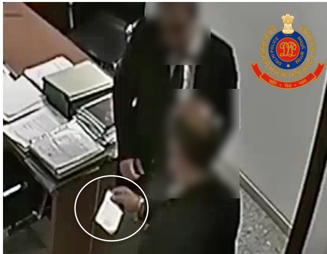
RENERGI executive allegedly offering a bribe to an Indian government official to win a 75 million dollar contract to build a new giant solar power plant near New Delhi.