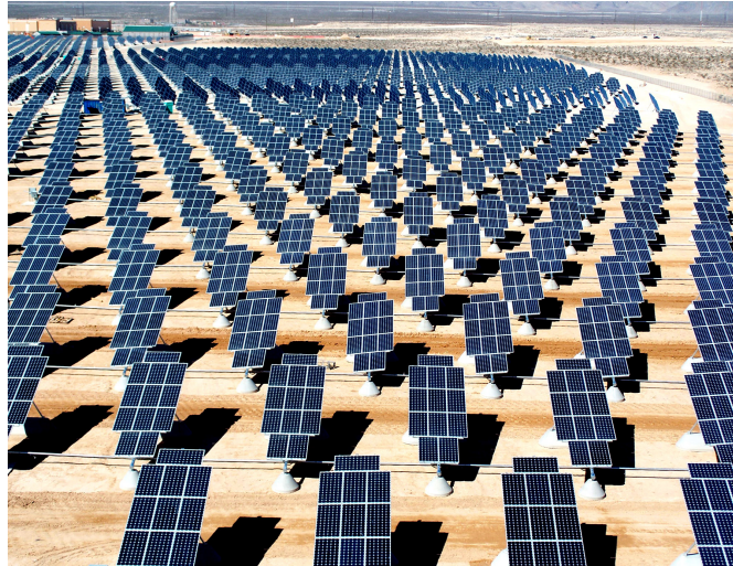
GIANT solar power plant built by Renergi near New Delhi, India. The power plant is one of several Renergi projects under investigation for alleged bribery.