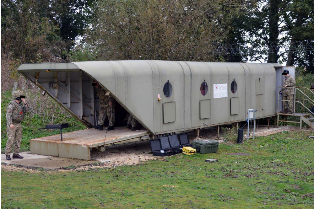
Figure 1: Chinook facsimile trainer at the Tactical Medical Wing of RAF Brize Norton.

1 2 3 4 5 6 7 8 9 10 11 12 13 14 15 16 17 18 19 20 21 22 23 24 25 26 27 28 29 30 31 32 33 34 35 36 37 38 39 40 41 42 43 44 45 46 47 48 49 50 51 52 53 54 55 56 57 58 59 60