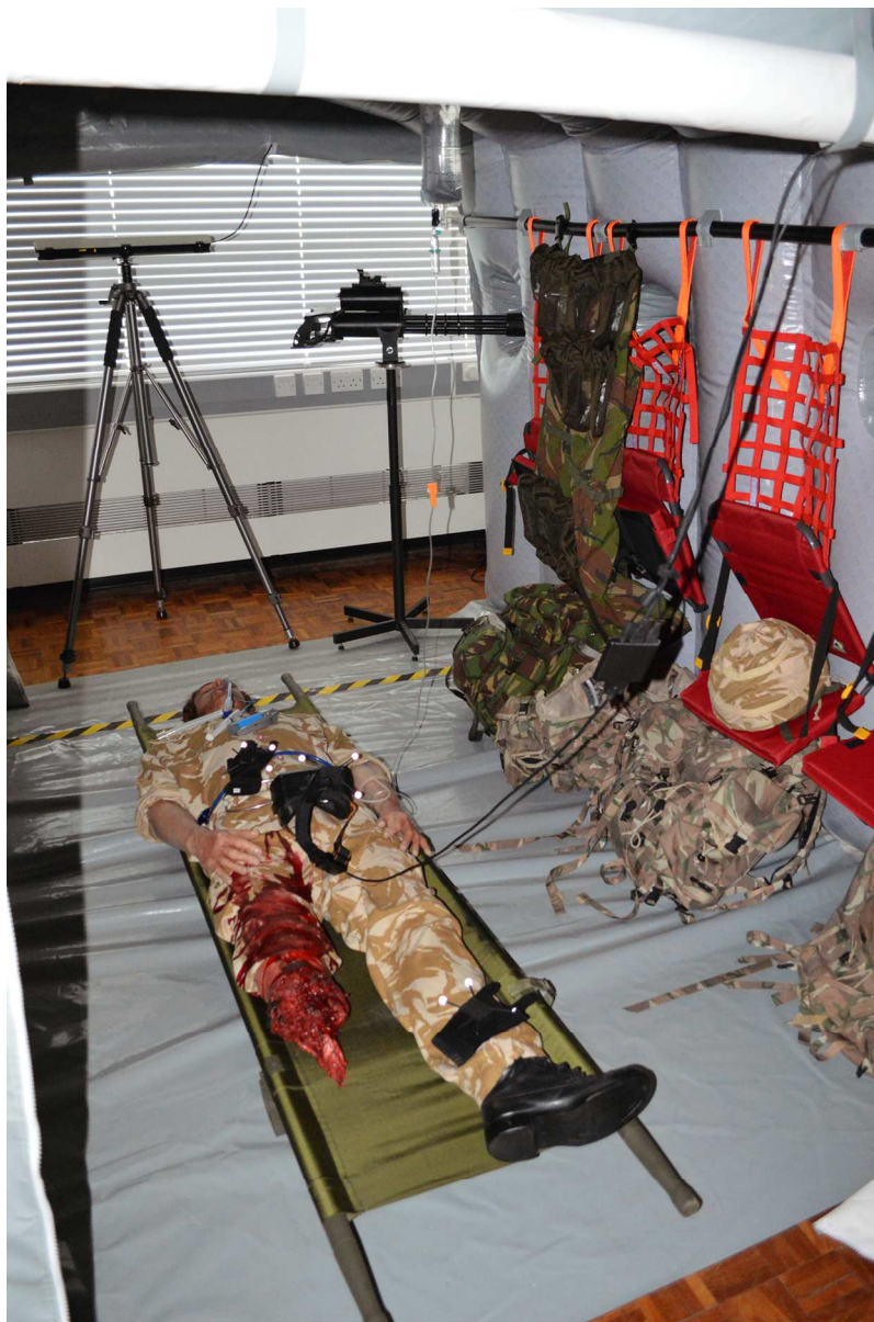
Figure 5: Inflatable enclosure with various additional elements, including a SIMBODIE mannequin.