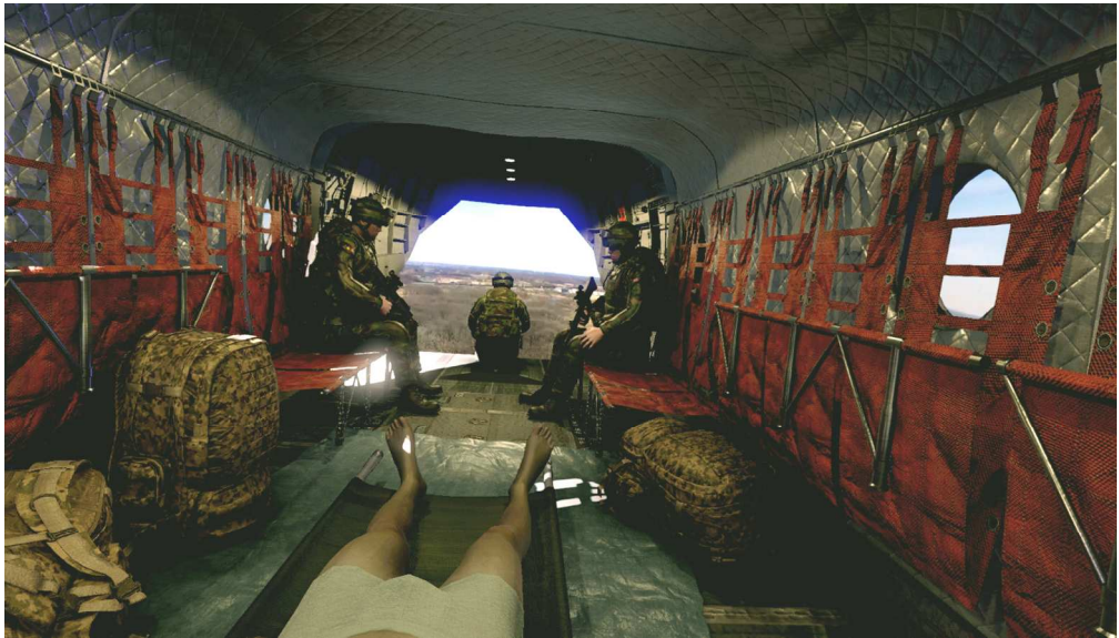
Figure 6: Interior view of the virtual Chinook cabin.

1 2 3 4 5 6 7 8 9 10 11 12 13 14 15 16 17 18 19 20 21 22 23 24 25 26 27 28 29 30 31 32 33 34 35 36 37 38 39 40 41 42 43 44 45 46 47 48 49 50 51 52 53 54 55 56 57 58 59 60