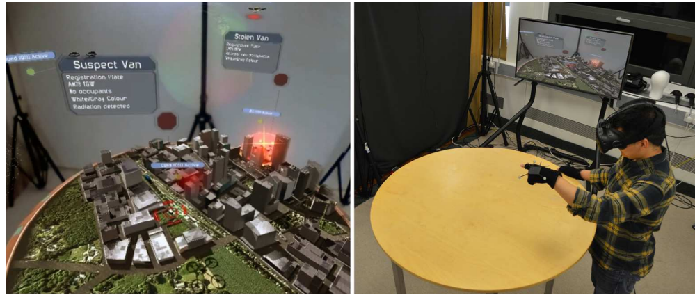
Figure 2: Mixed Reality Command and Control Concept Demonstrator – the MxR user (right image) is able to see the 3D cityscape scenario (left image) via the HMD and can interact with the displayed features and information panels using gestural commands, including sweeping motions on and around the otherwise empty table shown.