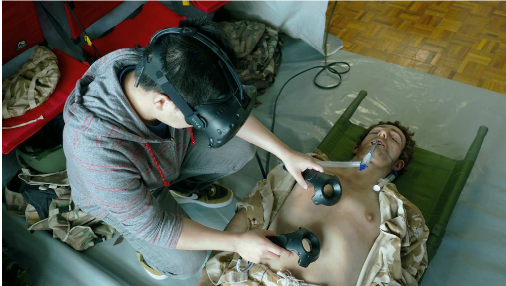
Figure 7: The HTC Vive HMD in use within the MERT trainer.