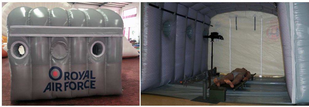
The basic MERT inflatable enclosure, external and internal views.

1 2 3 4 5 6 7 8 9 10 11 12 13 14 15 16 17 18 19 20 21 22 23 24 25 26 27 28 29 30 31 32 33 34 35 36 37 38 39 40 41 42 43 44 45 46 47 48 49 50 51 52 53 54 55 56 57 58 59 60