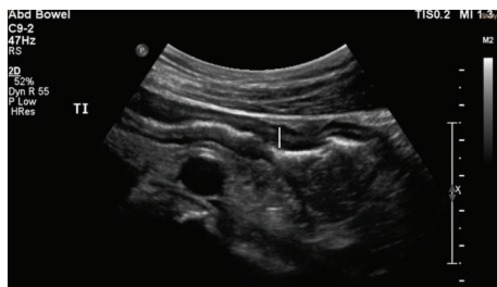
FIGURE 1: First suggestion of terminal ileal Crohn's disease identified on sonography, with thickened distal ileum running over the hypoechoic iliac artery. The white line marks the thickened ileal wall with echogenic or white air in the lumen.