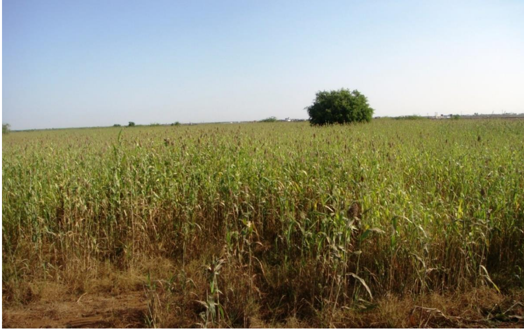
Figure 4: Standing millet crop at the time of solar park implementation

Yet even those developers who admitted that parts of the enclosed land were previously used for grazing and farming, downplayed its significance vis-à-vis the larger perceived benefits from the realisation of the project. For them, any negative impacts to the local communities in Charanka are outweighed by the positives promised by the development: