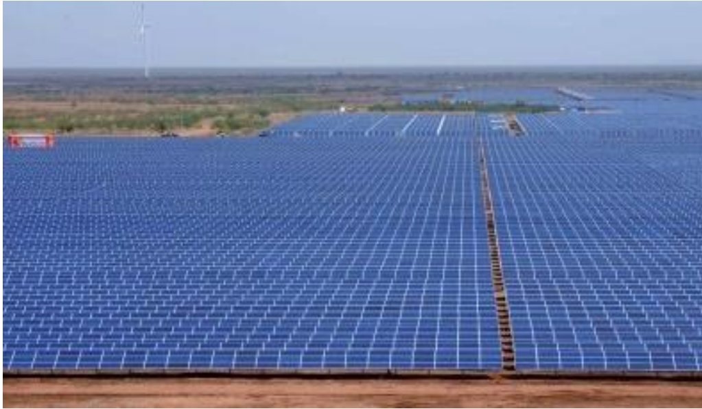
Figure 1: a view of Charanka Solar Park, Gujarat