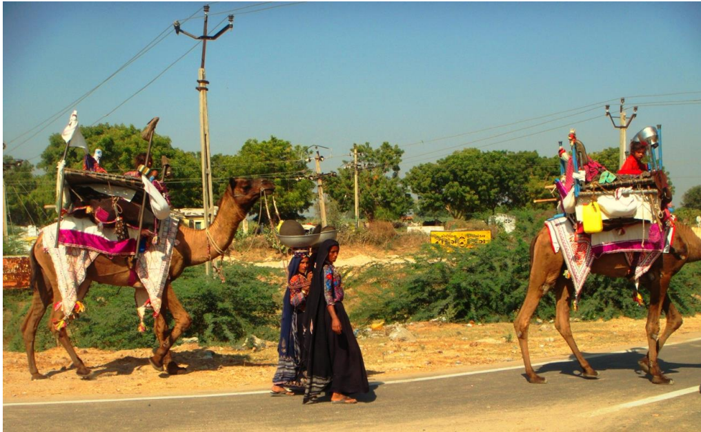
Figure 3: A Rabari family during their migratory movement period