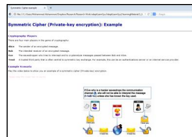
Figure 2. Concrete LO.