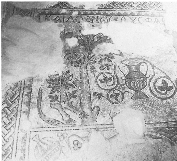
Figure 5 Ma'in, church on the Akropolis, mosaic (photo courtesy of †Michele Piccarillo).

by Byzantine anti-image legislation (or iconoclast beliefs) nor, it seems, was it spurred by any official Islamic policy: the edict against Christian images supposedly issued by the caliph Yazid II in 721 is now generally discounted as an anti-Islamic invention of later Christian writers (it is first mentioned in 787 at the seventh ecumenical Council of Nicaea). 45 Furthermore, many churches that were assuredly still in use in the mid-seventh century were not affected, and, most notably, there is no evidence of hostile destruction. As Robert Schick has argued forcefully, the disfigurement, when it appears, is so carefully done we must assume that the people who used and respected the buildings affected were responsible – in other words, the Christian congregations modified their own church floors. 46