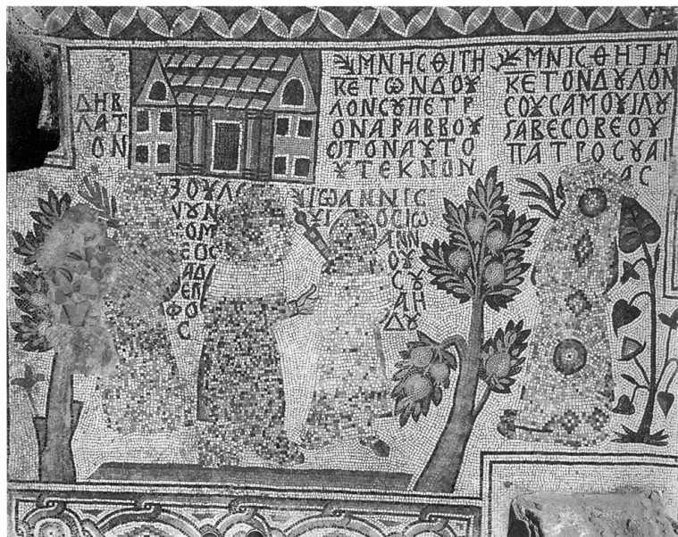
Figure 4 Umm al-Rasas, St Stephen's church, donor mosaics (photo courtesy of †Michele Piccirillo).

now shows a tree and an urn with bits of the ox protruding anarchically (Figure 5); the lion has not survived at all. 42