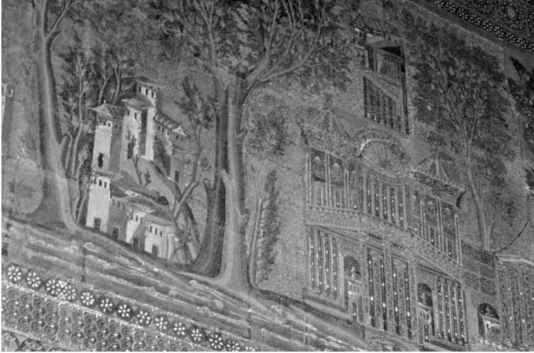
Figure 1 Damascus, Great Mosque, mosaic of river landscape (photo, Mosaics on the West portico, eighth century The Bridgeman Art Library Nationality/copyright status: out of copyright).

Damascus (Figure 1) – one of the earliest and most sacred buildings of Islam, dating to c. 715 – suggest that the real evil was not imagery per se , but representations of living creatures, including human beings. Even that was conditional: the material culture preserved from the long eighth century makes it very clear that it was only in the most holy areas of mosques that the prohibition was strictly applied. Baths (as, for example, in the eighth-century complex at Qusayr Amra) were exempt; animals and people certainly appear in the decoration of royal residences (as, for example, in the well-known floor mosaic of a lion attacking gazelles at Khirbat al-Mafjar, also of the eighth century: Figure 2); and images of animals (though not of people) appear in the more peripheral areas of several mosques, including those in the eighth-century complexes at (or formerly at) Mshatta and Qasr al-Hayr. And while the mosaics of the Dome of the Rock are dominated by decorative motifs, cityscapes and rural villa scenes, although unpeopled, appear a decade later, in the courtyard mosaics of the early eighth-century Great Mosque of Damascus, and look remarkably like contemporary and earlier Byzantine work. 3