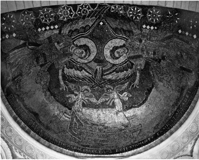
Figure 3 Germigny-des-Prés, oratory of Theodulf, apse mosaic.

ark of the covenant, which show the ark of Exodus, Theodulf's version demonstrates how the prophecies of the Old Testament, represented by the ark, have been replaced by the historical reality of Christ, whose incarnation fulfilled the promises of the old laws, and whose death and resurrection superseded them. The ark is now empty; Christ is present at the altar in the form of the eucharist. 38