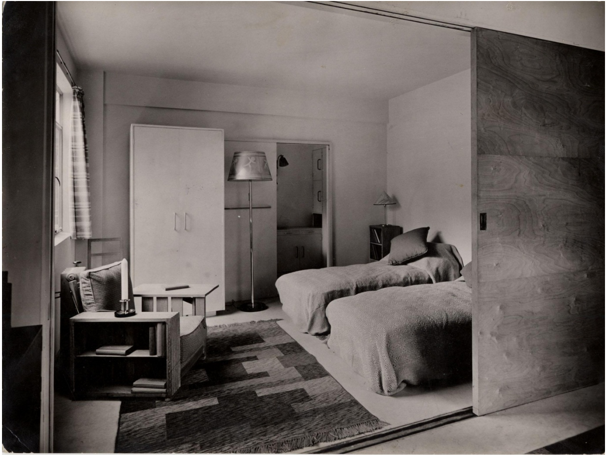
Figure 2: Lawn Road Flats, Bedroom.