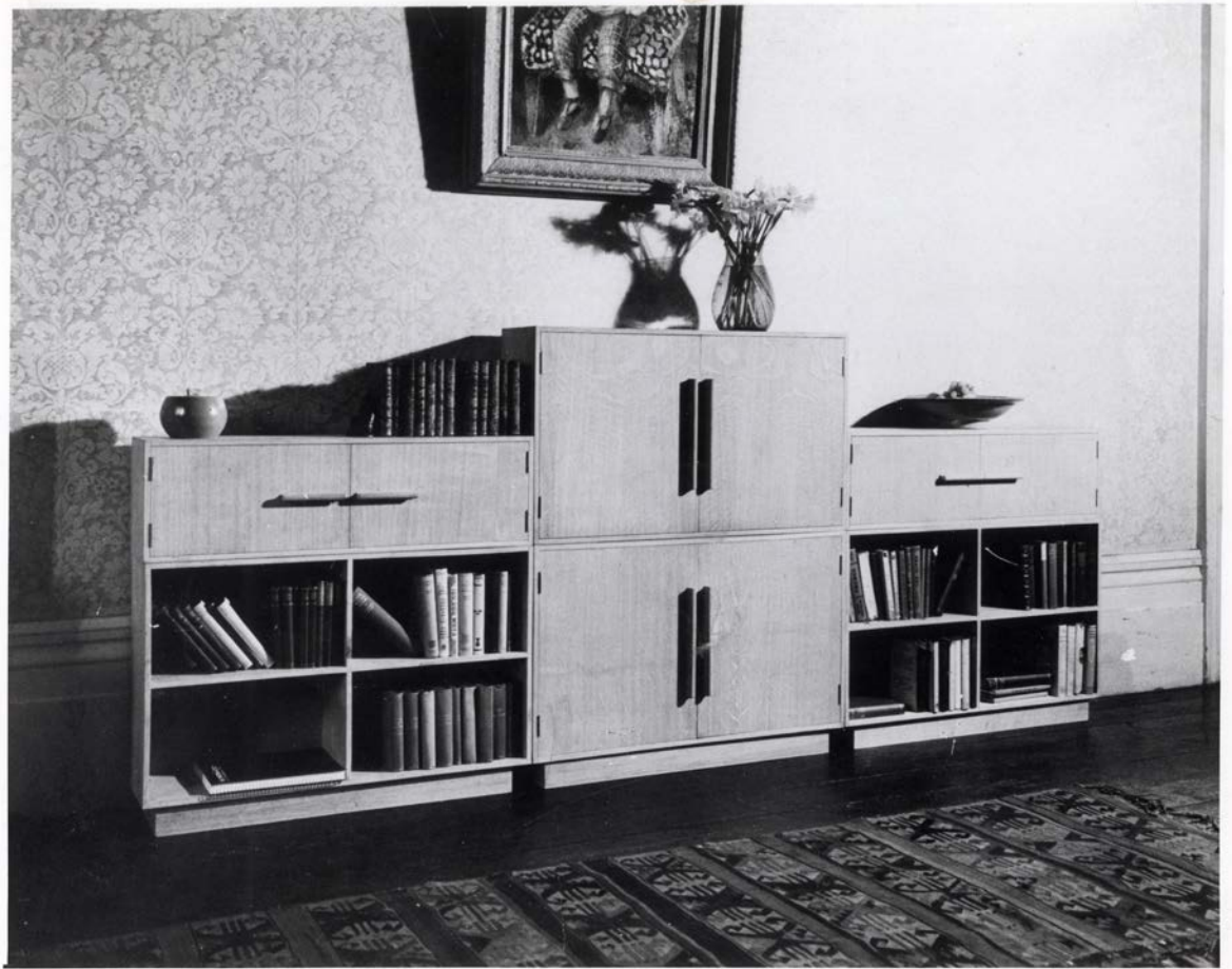
Figure 4: Modular Unit (courtesy of Pritchard Papers, University of East Anglia).

Far from being an isolated test case for modernist living in Britain, the records of the Isokon company clearly demonstrate that they were to be the first in a series of similar projects across the country, with flats planned in Manchester and in Birmingham (both of which failed because of the difficult economic climate in the later 1930s). Designed with reproducibility in mind, the modular interior structure of each flat meant that the erection of new buildings could be undertaken quickly and without excessive waste. The lifestyle it promoted was part of a wider move to educate the public about the ways in which best to furnish the home.