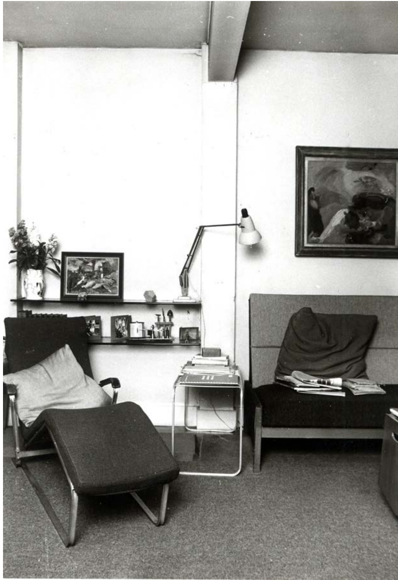
Figure 3: Lawn Road Flats, Living Room (courtesy of Pritchard Papers, University of East Anglia).