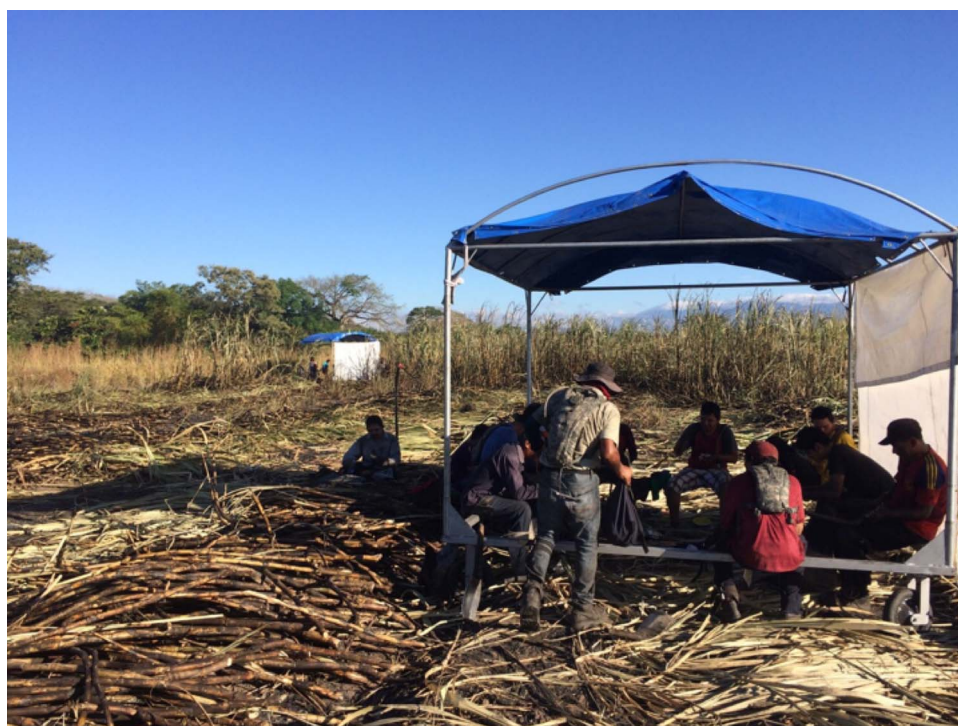
Figure 1 Workers in the cane field taking a break in the shade provided by the mobile canopies (note the wheels on the frame and the CamelBaks).

The Australian experts visited the fields, demonstrated the new methods to mill engineers and workers, and trained workers on how to use the machete during a 3-week period.