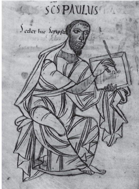
Stuttgart, Württembergische Landesbibliothek, HB II 54, f. 25v.

The COMPAUL project has received funding from the the European Union Seventh Framework Programme (FP7/2007–2013) under grant agreement no. 283302 (“The Earliest Commentaries on Paul as Sources for the Biblical Text”).