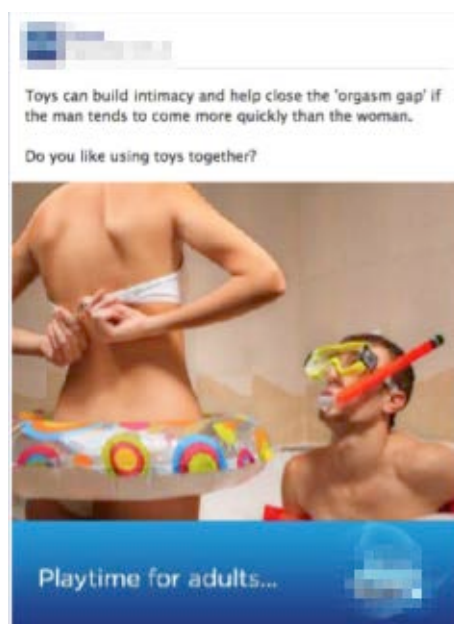
(2) Condom Branded Stimulus