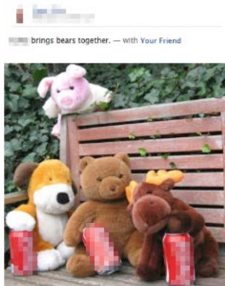
(1) Soft Drink Branded Stimulus

The following images were used as the content for the Brand Interaction (i.e. to measure whether participants would 'like' or share such content) and were presented as stimuli to research participants. The first (1) was used as the Soft Drink stimulus; the second (2) was used as the Condom stimulus.