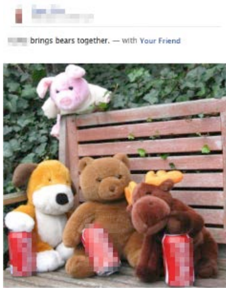
(1) Soft Drink Branded Stimulus

The following images were used as the content for the Brand Interaction (i.e. to measure whether participants would 'like' or share such content) and were presented as stimuli to research participants. The first (1) was used as the Soft Drink stimulus; the second (2) was used as the Condom stimulus.