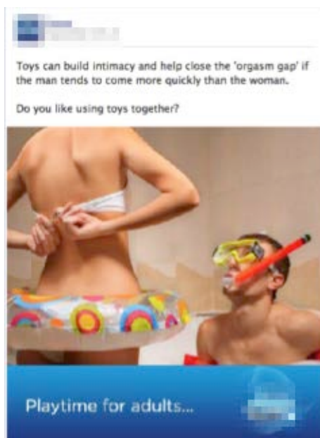
(2) Condom Branded Stimulus