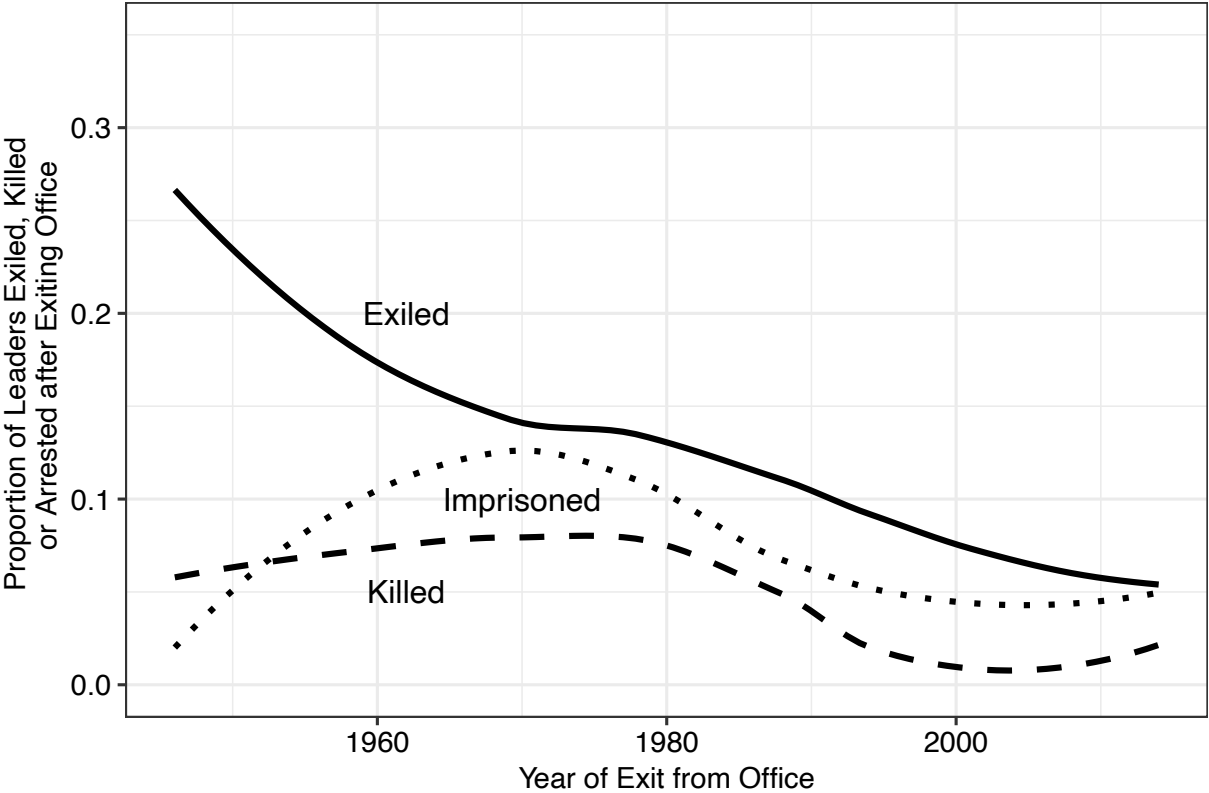
Figure 3. Political Leaders' Post-Tenure Fate, 1946-2015

Source: Authors' analysis using non-parametric local regressions (LOESS algorithm) based on Archigos data set.