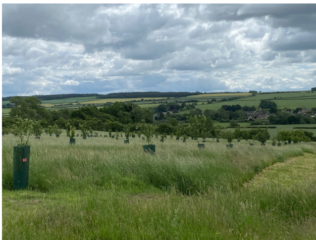
FIGURE 1 Emerging tree plantation in Honeydale Farm, Cotswold, England (UK). Large saplings are planted widely spaced (5 m apart as a guess) and protected from grazing animals (particularly deer) by tree guards that will be removed soon now that the trees have escaped the danger of being grazed to extinction.

Woodland currently covers about 12% of the United Kingdom (2.84 million ha), a figure that is below the European average of 37%. Nevertheless, the pivotal importance of forests and forest diversity in sequestering carbon has taken centre stage with ambitious projects across the United Kingdom designed to greatly increase tree planting and bring existing forests into management. The 2021 Environment Act sets environmental targets including an increase of tree and woodland cover to 16.5% of total land area in England by 2050, but the 2023 report of the UK Climate Change Committee felt sufficiently unsure of the level and delivery of this target to recommend (The UK Climate Change Committee, 2023) that funding and support must be “set at the correct level to meet the UK Government afforestation target of 30,000 hectares per year by 2025 and the illustrative net-zero strategy targets