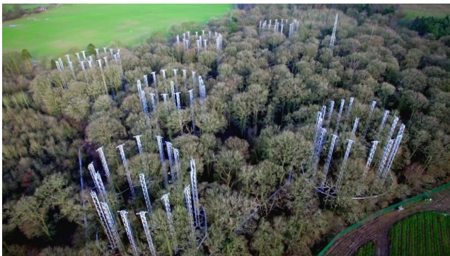
FIGURE 2 Aerial photograph of the BIFoR FACE facility in the Norbury Park estate (UK).

biomes as argued by Norby et al. (2016) and Caldararu et al. (2023). The BIFoR FACE facility is the world's largest climate change experiment and the only forest FACE facility in the northern hemisphere (Figure 2). Over a season, the deciduous woodland patches exposed to elevated CO 2 at BIFoR FACE show about a 25% increase in photosynthesis compared to the woodland in contemporary air (Gardner, Ellsworth, et al., 2022). The general trends and patterns are clear. The 'water cost of carbon gain' is reduced by ~40% under elevated CO 2 (Gardner, Ellsworth, et al., 2022; Gardner, Mingkai, et al., 2022). The enhanced carbon gain influences tree physiology, leading, at least initially, to greater fine root production (Ziegler et al., 2022) and enhanced release of nutritious exudate into the surrounding soil for priming nutrient acquisition for sustaining C capture. This in turn benefits the soil microbiome leading to increased microbial biomass and more carbon belowground overall. The benefits delivered by woodland are determined by location and can be scientifically modelled across landscapes using data from BIFoR FACE and other experimental manipulations to ground-truth model predictions (Norby et al., 2016), thereby increasing our confidence in our strategies for climate-resilient future forests.