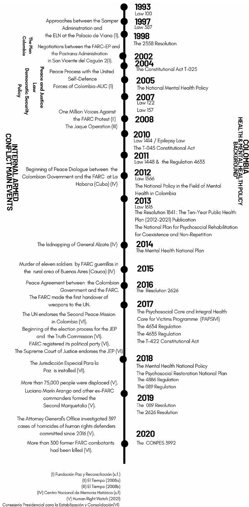
Fig. 1 Colombian Mental Health System Timeline (from 1993 to 2020)