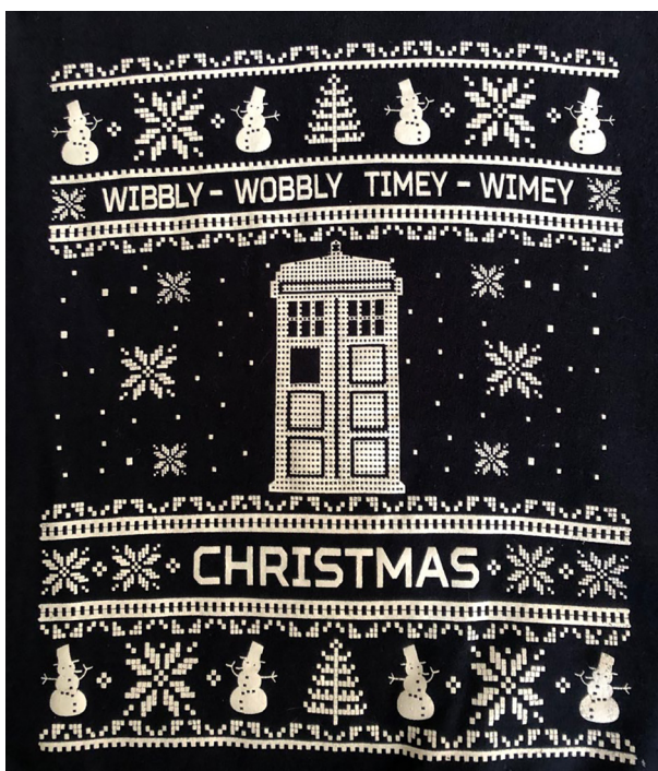
Fig 1 | The TARDIS has even landed on a Christmas jumper

The main outcome was age standardised mortality rate because, unlike crude rates, this allows a fairer comparison between populations with different age structures over time. The ONS standardises the data to the 2013 European standard population. Rates were analysed from 1964 (the year after Doctor Who was first broadcast) onwards, but to avoid confounding from the covid-19 pandemic, data after 2019 were not included. Analyses were first conducted using the age