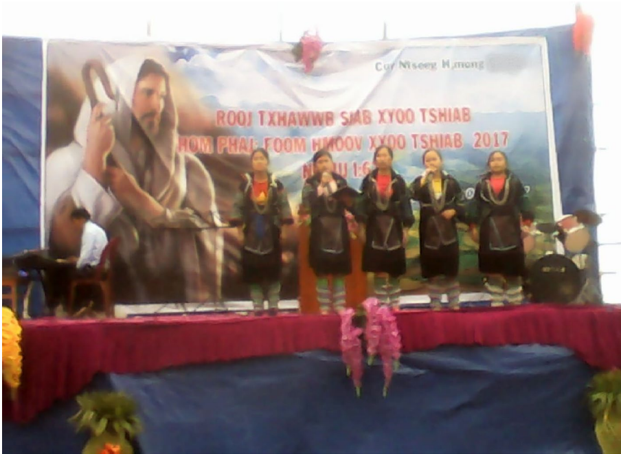
Figure 1 Main stage of Lunar New Year Christian festival [Colour figure can be viewed at wileyonlinelibrary.com ]

stage, equipment, food, transport etc. The festival included preaching, worship songs, secular musical and dance performances, a talent contest, traditional New Year games and a huge lunch – distributed to everyone in plastic containers.